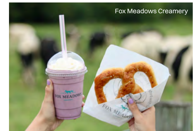
Fox Meadows Creamery

Warm wood-fired ovens, handmade pasta and seasonal ingredients set the tone at LUCA. A multiple-time James Beard Award semifinalist, the restaurant draws inspiration from Italy while making the most of Lancaster County's abundant local produce, meats and cheeses. Whether you're sharing a pizza, lingering over a pasta dinner or enjoying a glass of wine, the atmosphere is lively, welcoming and distinctly Lancaster. 436 W. James St., Lancaster. LucaLancaster.com