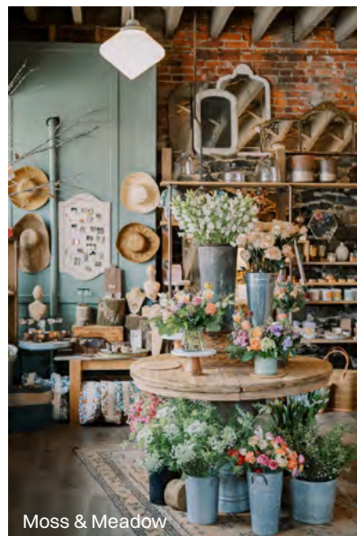
Moss & Meadow

Looking to refresh your wardrobe? Find boho-chic styles at 12 West , contemporary fashion at Posh Collections , designer consignment at Vida Beale and special-occasion attire at Occasions . In the Malvern Shopping Center, Englund's Apparel specializes in fine menswear and custom clothing, while Silver Linings Boutique offers fashionable women's apparel and accessories. MalvernBusiness.com