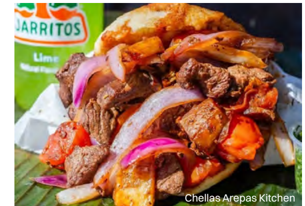
Chellas Arepas Kitchen

At Fox Meadows, ice cream starts with milk from the family's own dairy farm. Choose from the original location on a working farm in Ephrata, where outdoor seating overlooks grazing cows and rolling fields, or stop by the charming Leola location in the heart of Lancaster County. Both serve rich scoops, sundaes and milkshakes featuring seasonal flavors and farm-fresh ingredients. 2475 W. Main St., Ephrata & 193 E. Main St., Leola. FoxMeadowsCreamery.com