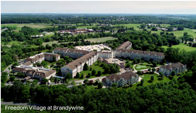
Freedom Village at Brandywine