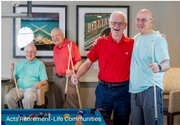
Acts Retirement-Life Communities