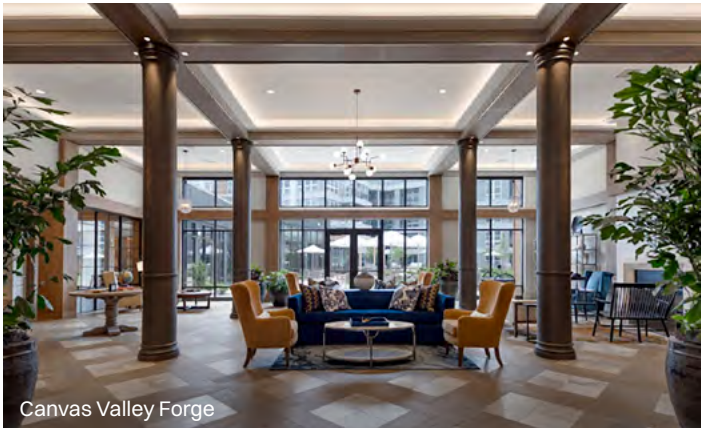
Canvas Valley Forge

White Horse Village 610-558-5000 WhiteHorseVillage.org