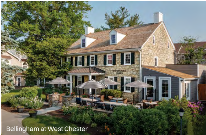
Bellingham at West Chester