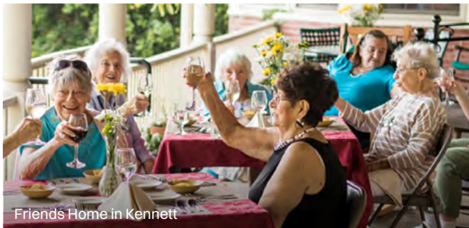
Friends Home in Kennett