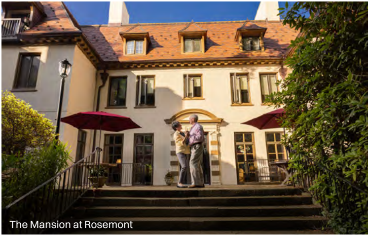
The Mansion at Rosemont