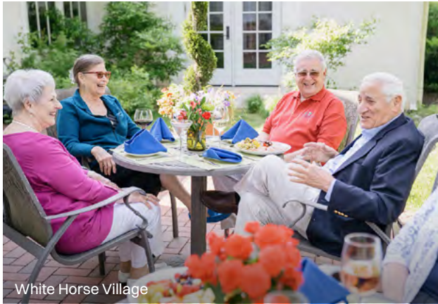
White Horse Village