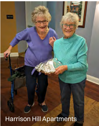
Harrison Hill Apartments