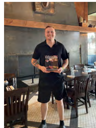
The Towne House Best of Media