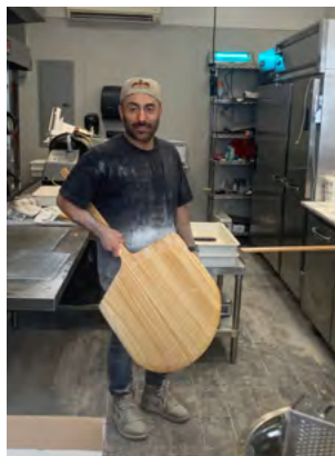
Pizza West Chester Best of West Chester