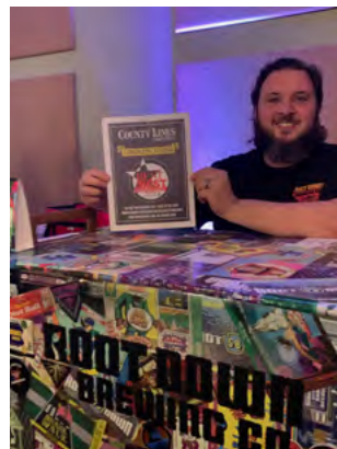
Root Down Brewing Co. Best of Phoenixville