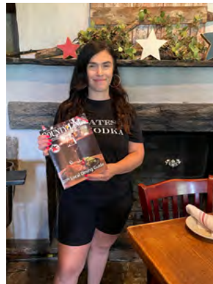
La Porta Best of Media