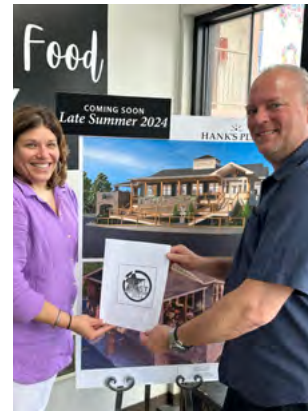
Hank's Place Best of Kennett Square