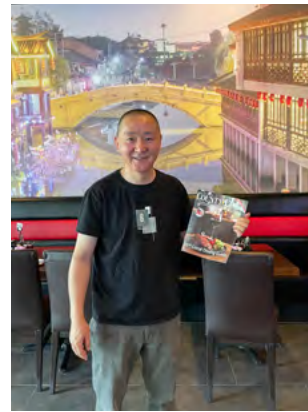
Dim Sum Mania Best of Media