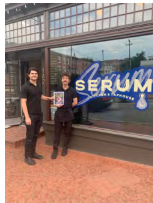
Serum Kitchen & Taphouse Bars & Beers