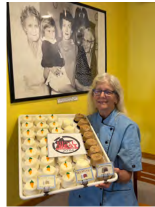
Dixie Picnic Best of Malvern