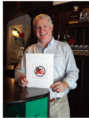
Bar Reverie Welcome New Restaurants