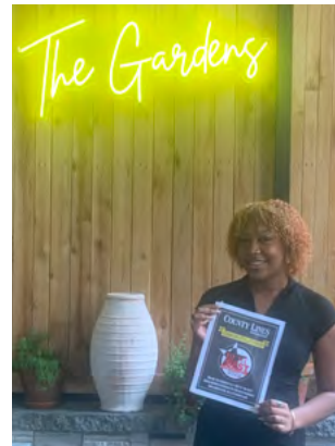
Limoncello Ristorante Best of West Chester