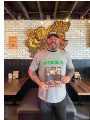
Pinocchio's Restaurant Best of Media