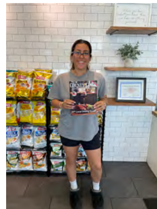
Steaks West Chester Steaks Are Happening