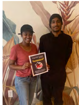
Manjé Caribbean Cuisine Welcome New Restaurants