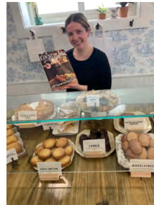
Pâtisserie Lola Morning Brews & Sweet Treats