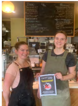
La Baguette Magique Best of West Chester