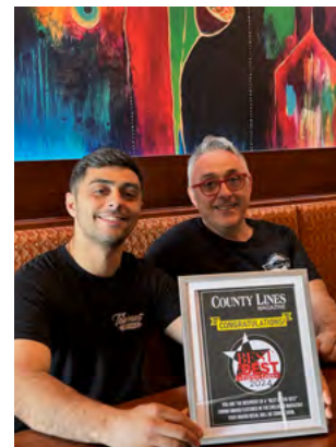
Tonino's Pizza & Pasta Co. Best of Malvern