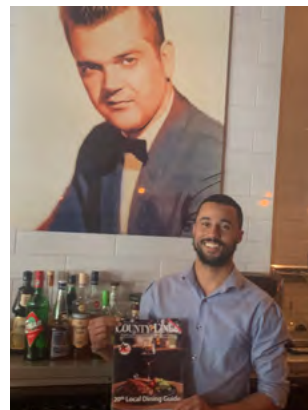
Slow Hand Best of West Chester