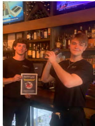
Mercato Best of West Chester