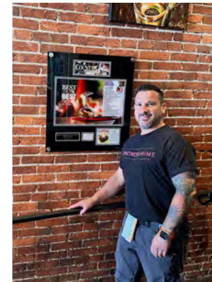
Pietro's Prime Steakhouse & Martini Bar Best of West Chester