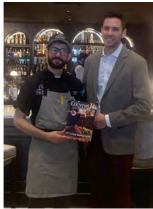
9 Prime Steaks Are Happening

Back in January, we named over 100 outstanding restaurants “Best of the Best” winners. In the following months, we got to meet some of the faces behind the food — presenting them with their well-deserved awards and thanking them for offering fantastic food, drinks and hospitality.