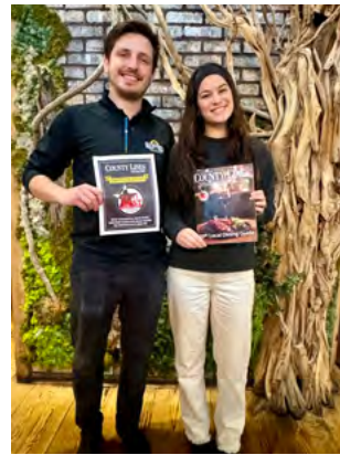
Brick & Brew Best of Malvern