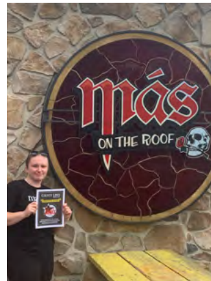
Más Mexicali Cantina Best of West Chester