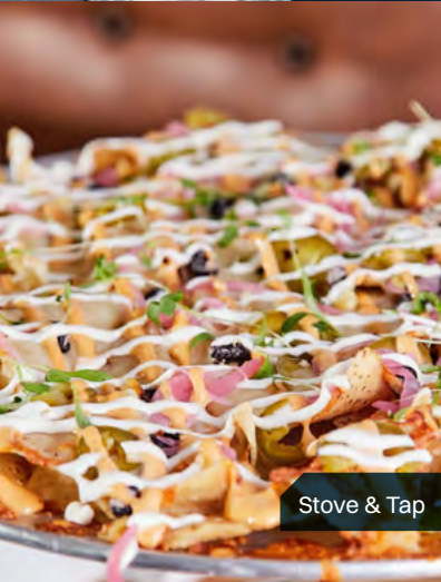
Stove & Tap

cial like the $4 dog and tot combo. 146 W. Gay St. Jitters-WC.com