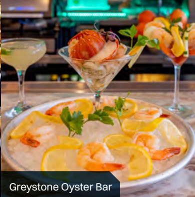
Greystone Oyster Bar