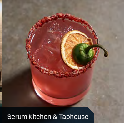
Serum Kitchen & Taphouse