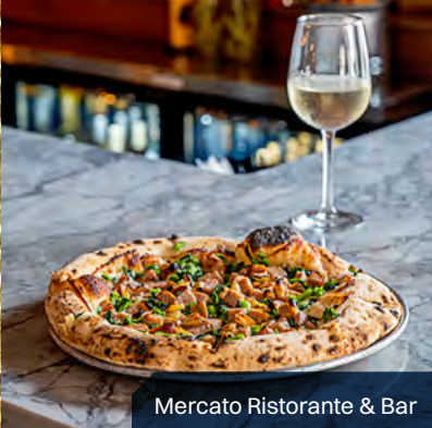
Mercato Ristorante & Bar