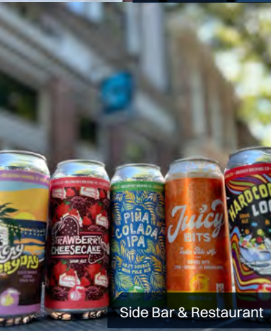
Side Bar & Restaurant