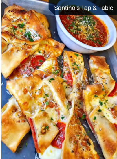
Santino's Tap & Table

When it's nice, check out the redesigned "Florida Room," a back patio that would make Jimmy Buffet proud. Happy Hour runs weekdays, 4 to 6. Beers are $2, well drinks $3, plus limited food spe-