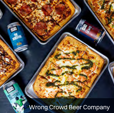
Wrong Crowd Beer Company