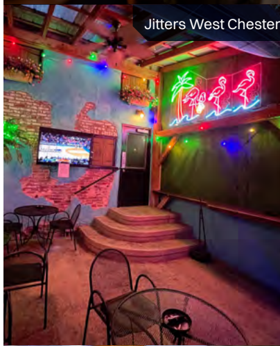
Jitters West Chester

C ONGRATULATIONS, YOU'VE MADE it. The workday is done, and now it's time to celebrate. What better way than at a local Happy Hour?