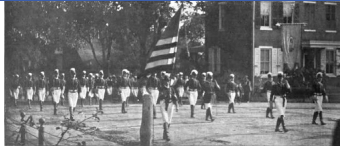
West Chester Pioneer Corps at Washington and Matlack Streets, 1899