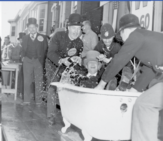
Left to right: West Chester Sesquicentennial Celebration, 1949