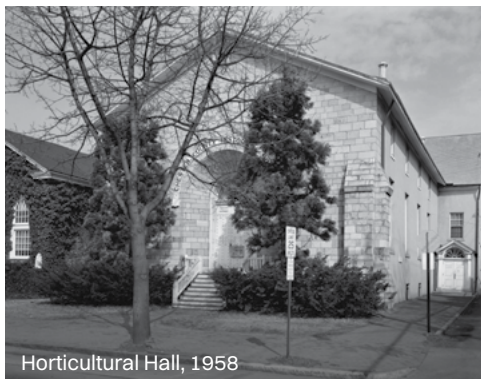
Horticultural Hall, 1958