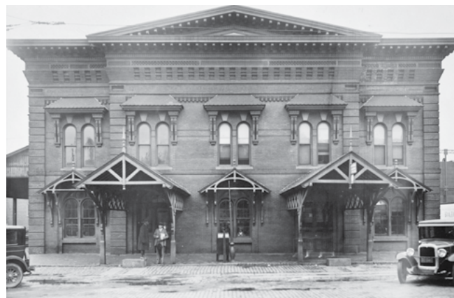
Pennsylvania Railroad Station on Market Street c. 1930

As populations shifted, Chester County saw a need to move county functions closer to people at the edges of the territory.