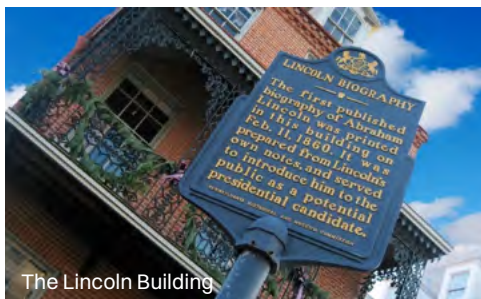
The Lincoln Building