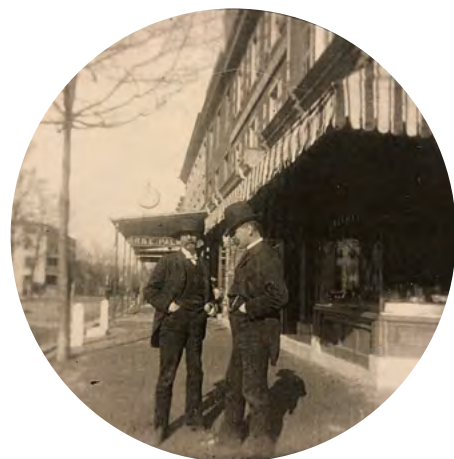
Historic photos like these will be featured on a new mural from the Public Arts Commission later this year.