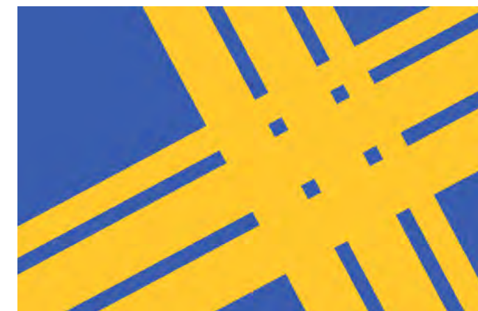
Official flag of West Chester. The six stripes represent West Chester’s first streets: Market, High, Gay, Chestnut, Church and Walnut

To keep up to date, check the West Chester Parks and Recreation Facebook page. ♦