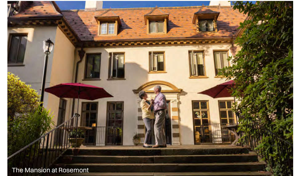
The Mansion at Rosemont

For over 50 years, Acts Retirement—Life Communities have offered the residents