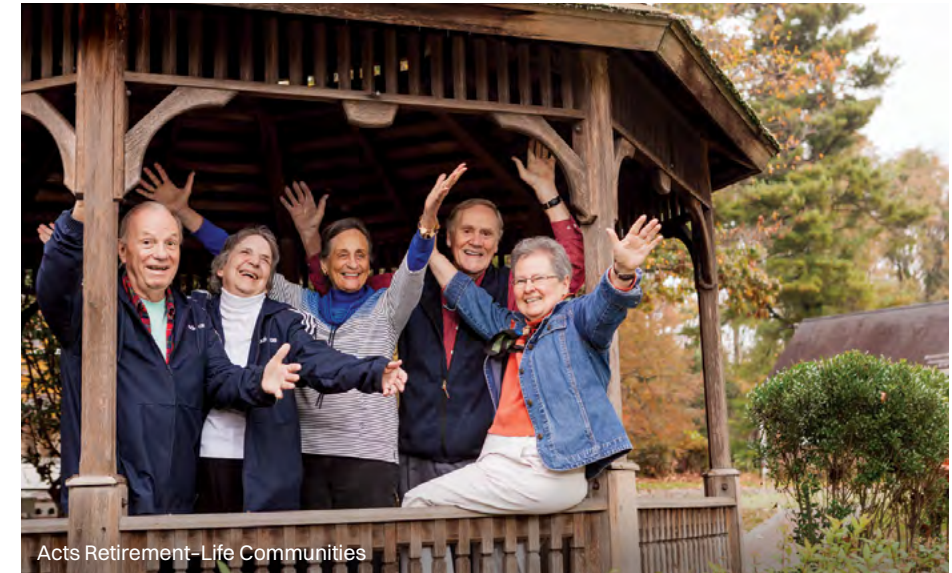
Acts Retirement-Life Communities

Please visit our online Guide at CountyLinesMagazine.com