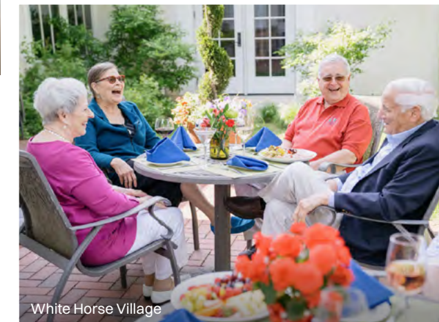
White Horse Village