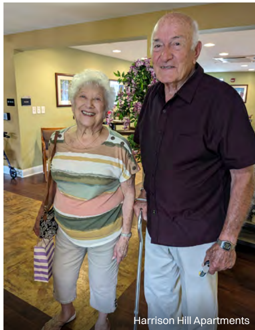
Harrison Hill Apartments