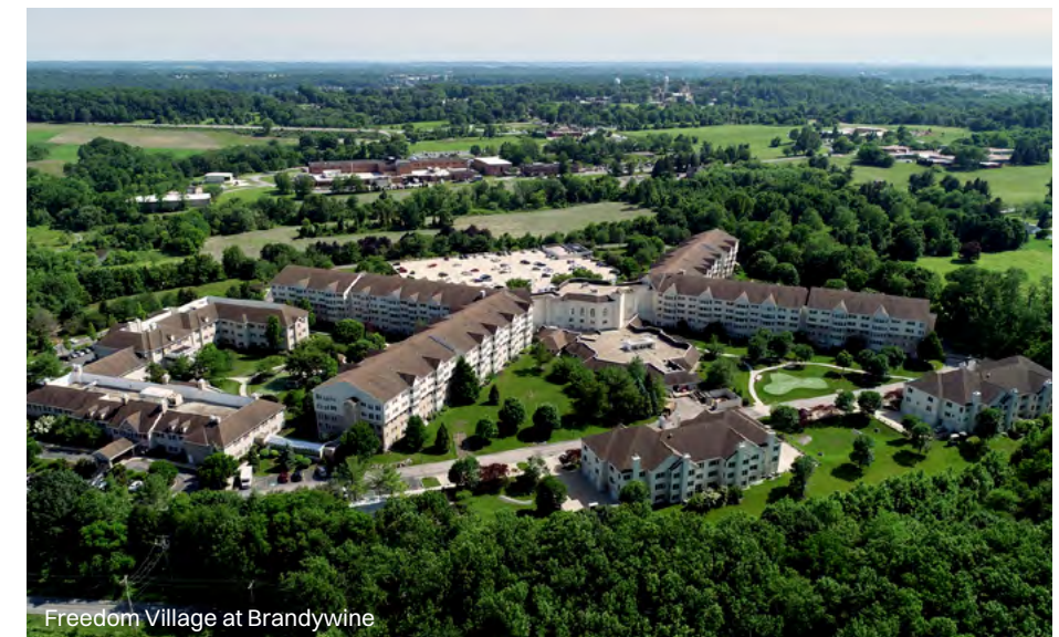
Freedom Village at Brandywine