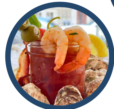
Greystone Oyster Bar