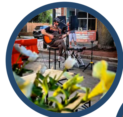
Stove & Tap

Summer in West Chester just wouldn't be the same without plates piled high with your seasonal favorites. And this year promises to be