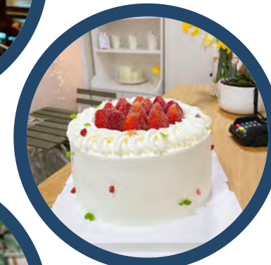
Eden Sweet House