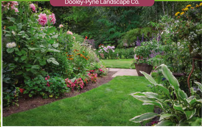
Dooley-Pyne Landscape Co.