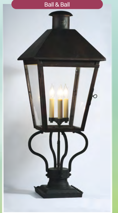
Ball & Ball

Shreiner Tree Care 334 S. Henderson Rd., King of Prussia 610-265-6004; ShreinerTreeCare.com ♦