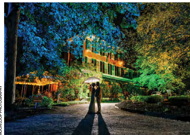
MOON LOOP PHOTOGRAPHY