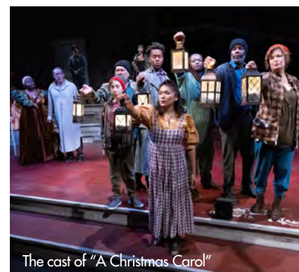
The cast of "A Christmas Carol"

People's Light has big plans in 2022. Personality: The Lloyd Price Musical is the world's first musical to celebrate that Rock & Roll Hall of Fame legend. Hold These Truths is inspired by the true story of Gordon Hirabayashi and his activism