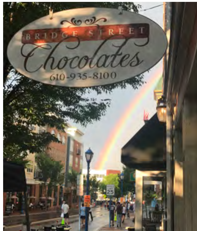
BRIDGE STREET CHOCOLATES 610-935-8100 • BridgeStreetChocolates.com

Bridge Street Chocolates is ready and eager to help you spread holiday cheer through their safe, efficient services and gourmet chocolates. Select one of our newest offerings with their decadent hot cocoa pods, seasonal truffles and assorted chocolate favorites. They offer online ordering, curbside pickup, local delivery and shipping to all 50 states. They're grateful for your support! 158 Bridge St. 610-935-8100; BridgeStreetChocolates.com.