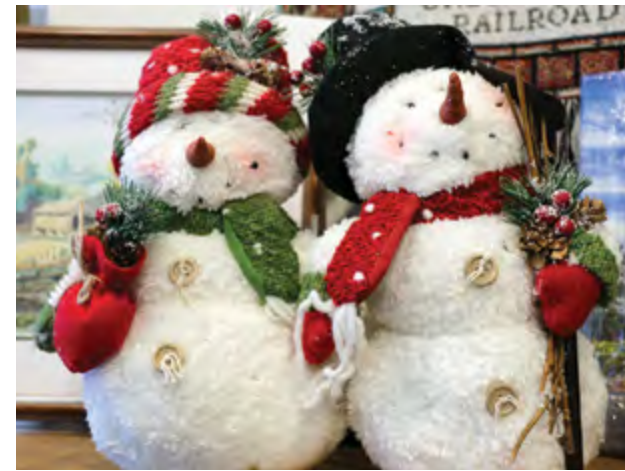
CHESTER COUNTY HISTORY MUSEUM SHOP 610-692-4800; ChesterCoHistorical.org

Chester County History Museum Shop offers outstanding gifts, books, children's merchandise and home decor inspired by our museum/library. We are pleased to highlight local items, artists and authors. Your purchases are an important means of support for our mission to "inspire, inform, and build community identity by preserving and sharing the remarkable story of Chester County and its people." 225 N. High St. 610-692-4800; ChesterCoHistorical.org.