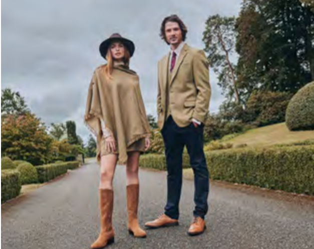
DUBARRY OF IRELAND Also in Wayne, PA. See Dubarry.com for details

Dubarry of Ireland —A heritage maker of outdoor apparel and GORE-TEX lined leather footwear since 1937. Whatever the weather, they've got you covered. Visit their Holiday Pop-Up Shop locations in: Greenville, DE, Wayne, PA and Oxford, PA. See dubarry.com for details. 3856 Kennett Pk. 610-932-8742; Dubarry.com .