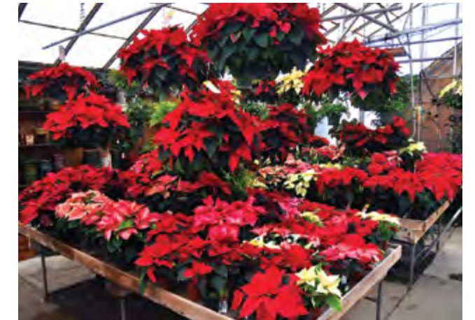
MOSTARDI NURSERY 610-356-8035 • Mostardi.com

Get your Christmas plants and flowers at Mostardi Nursery . Featuring distinctive plants for every season, Mostardi offers a selection that will have your home looking greener and even better than last Christmas. The Christmas Shop features trees, wreaths, poinsettias, garden accents, ornaments and accessories. Mostardi is dedicated to providing avid gardeners and homeowners with plants for every season and every reason. 4033 West Chester Pk. (Rt. 3). 610-356-8035; Mostardi.com.