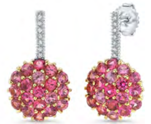
WALTER J. COOK JEWELER 610-644-5347 • WalterJCookJeweler.com