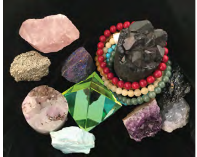
DELAWARE MUSEUM OF NATURAL HISTORY 302-658-9111 • DelMNH.org

Put a little natural sparkle into the holidays with science and nature-related gifts from the Delaware Museum of Natural History , including crystals, collectible rocks, stone jewelry, apparel, and more. For children, stuffed animals, science kits, books, games, puzzles and more. And, of course, dinosaur gifts! Shop at the Museum through December 31 (Museum building is closed in 2021), online shopping is available now and throughout next year at delmnhsquare.site . 4840 Kennett Pk. 302-658-9111; DelMNH.org .