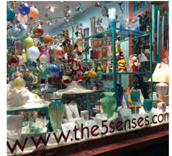
THE 5 SENSES 610-719-0170 • The5Senses.com

for yourself as well) at this local shop. Offering North American and Fair Trade, handmade, functional works of art, from pottery to candles to jewelry and gift art, they also have a large selection of all occasion cards, gift cards, gift wrapping and shipping. Shop online, too. 133 W. Market St. 610-719-0170; The5Senses.com.