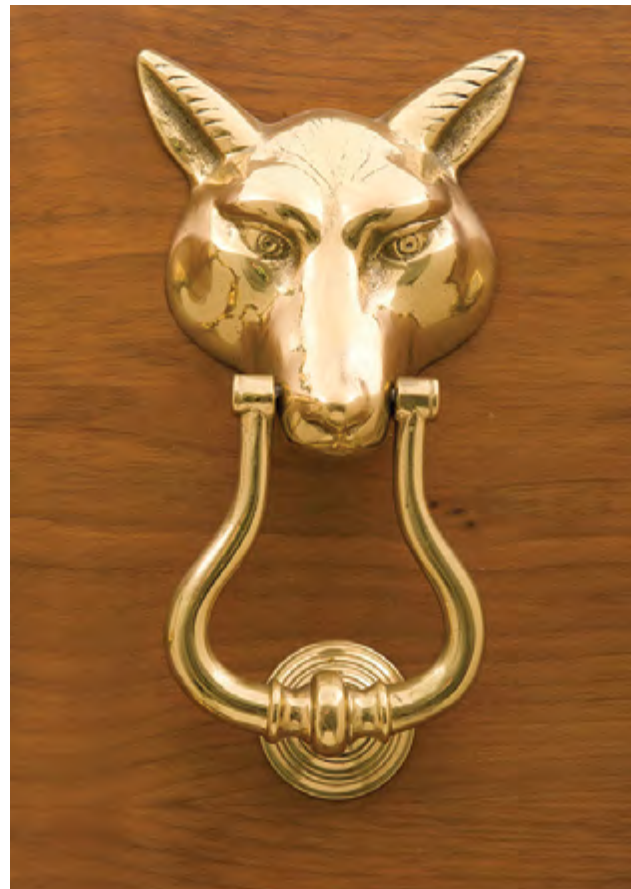
BALL & BALL 610-363-7300 • BallAndBall.com

Deck the halls this holiday season with 18th-century through Victorian-era original and reproduction furniture, lighting fixtures and furniture hardware. Visit the showroom at Ball & Ball to find unique gift ideas including candlesticks, bookends, lanterns and fireplace accessories made on the premises in brass, tin, copper and hand-forged iron and bronze. All perfect gifts this holiday season. Open Monday–Thursday, from 8 to 4:30, Friday 8 to 1; 463 W. Lincoln Hwy. (Rt. 30). 610-363-7330; BallAndBall.com.