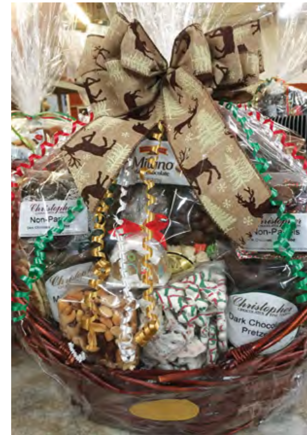
CHRISTOPHER CHOCOLATES 610-359-1669 • Christopher-Chocolates.com

Gourmet gift baskets and luscious fine chocolates are two reasons to stop at Christopher Chocolates , making life sweeter since 1986 as a family-owned and operated business. They have a great selection of gourmet foods, candies, sugar-free items and fine chocolates for a customized gift basket to delight all on your list. Open daily from Thanksgiving to Christmas. 3519 West Chester Pk. (Rt. 3). 610-359-1669; Christopher-Chocolates.com.