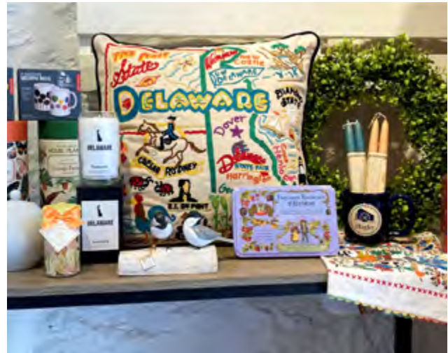
HAGLEY MUSEUM & LIBRARY 302-658-2400 • Hagley.org

Leave the crowds of the mall behind and shop Hagley Museum and Library's Museum Store online or in person. Find thoughtful gifts for everyone on your list. Gift suggestions include hand-embroidered pillows, holiday tea towels, candles, hot toddy mixes, puzzles, and toys. Stay to see entries in the, "Hometown Heroes" Gingerbread House contest. 200 Hagley Creek Rd. 302-658-2400; Store.Hagley.org or Hagley.org/Holidays . ♦