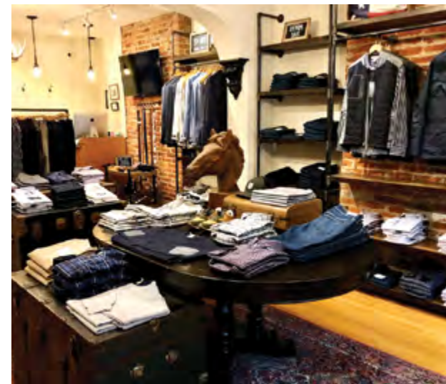
PHINEAS GAGE 610-266-7 344 • Phineas-Gage.com

Looking for the perfect gift for the men in your life? Check out Phineas Gage , located in downtown West Chester for a great assortment of men's contemporary clothing and accessories. They carry everything from outerwear, sweaters, wovens, denim to socks, belts and wallets. Let them help you pick the perfect gift to outfit your man from head to toe! 29 S. High St. 484-266-7344; Phineas-Gage.com.