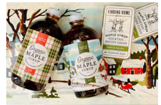
ADORN GOODS 302-575-9657; • AdornGoods.com

Happy Holidays! Adorn Goods welcomes you to enjoy the destination and experience the joy of in-person shopping this holiday season. A Modern General Store located in Centreville, Delaware Adorn Goods has a safe, small shop environment for all your perfect gifts and fine goods. Truly unique and something for everyone. Stop in... Shop... Stay for a while. 5712 Kennett Pk. 302-575-9657; AdornGoods.com.