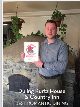
Duling Kurtz House & Country Inn BEST ROMANTIC DINING