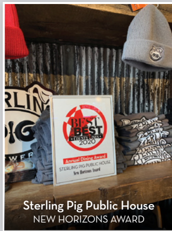
Sterling Pig Public House NEW HORIZONS AWARD