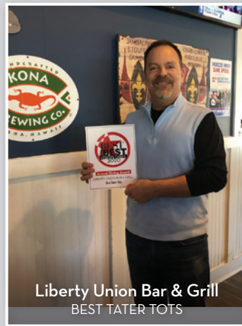
Liberty Union Bar & Grill BEST TATER TOTS