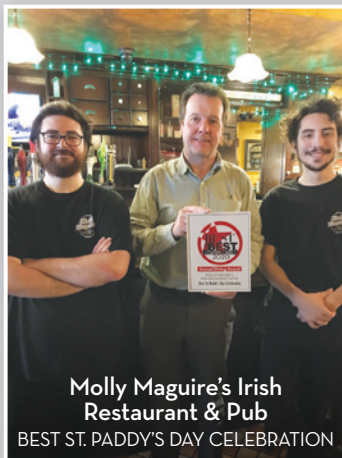
Molly Maguire's Irish Restaurant & Pub BEST ST. PADDY'S DAY CELEBRATION