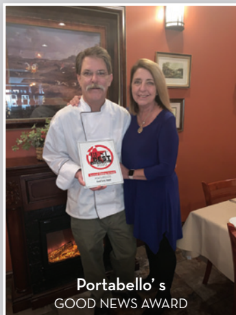
Portabello's GOOD NEWS AWARD