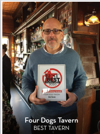
Four Dogs Tavern BEST TAVERN