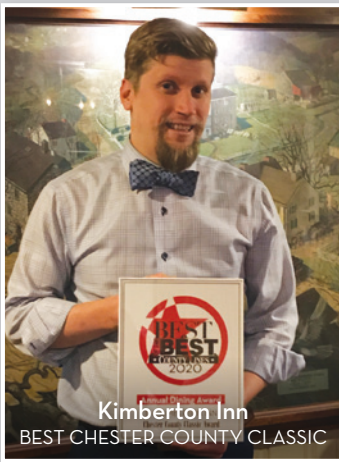
Kimberton Inn BEST CHESTER COUNTY CLASSIC