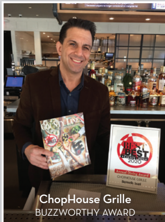
ChopHouse Grille BUZZWORTHY AWARD