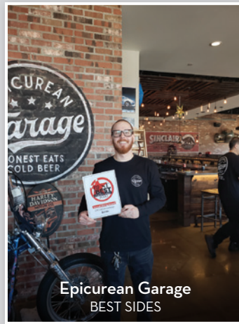
Epicurean Garage BEST SIDES