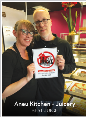
Aneu Kitchen + Juicery BEST JUICE