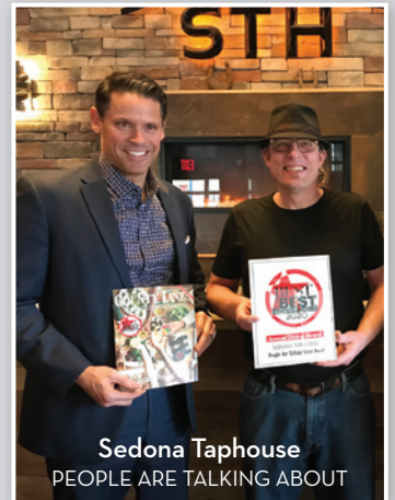
Sedona Taphouse PEOPLE ARE TALKING ABOUT