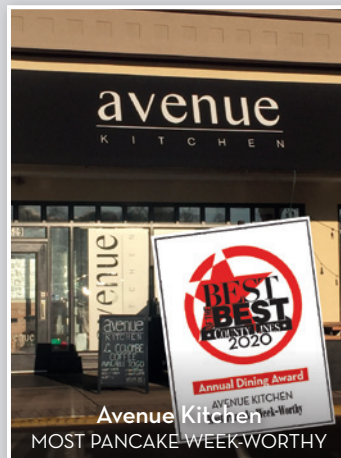
Avenue Kitchen MOST PANCAKE WEEK-WORTHY