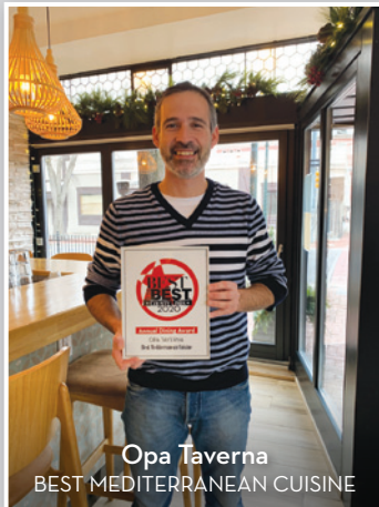
Opa Taverna BEST MEDITERRANEAN CUISINE