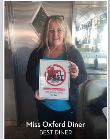
Miss Oxford Diner BEST DINER