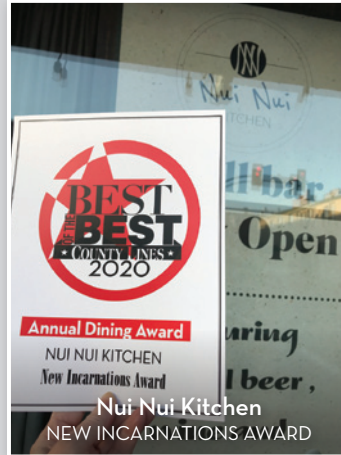
Nui Nui Kitchen NEW INCARNATIONS AWARD