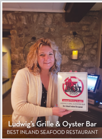
Ludwig's Grille & Oyster Bar BEST INLAND SEAFOOD RESTAURANT