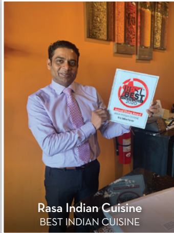
Rasa Indian Cuisine BEST INDIAN CUISINE