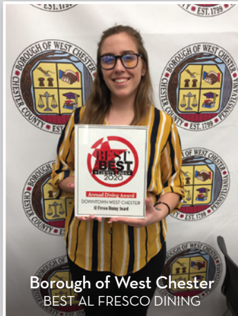
Borough of West Chester BEST AL FRESCO DINING