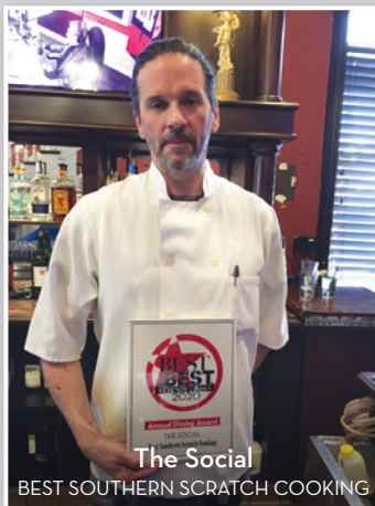
The Social BEST SOUTHERN SCRATCH COOKING