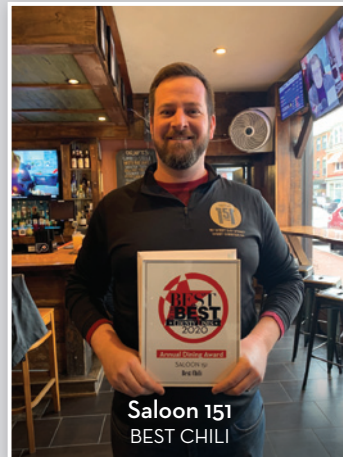
Saloon 151 BEST CHILI