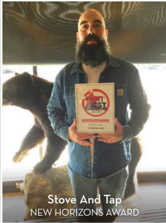
Stove And Tap NEW HORIZONS AWARD