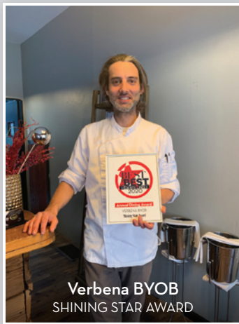
Verbena BYOB SHINING STAR AWARD