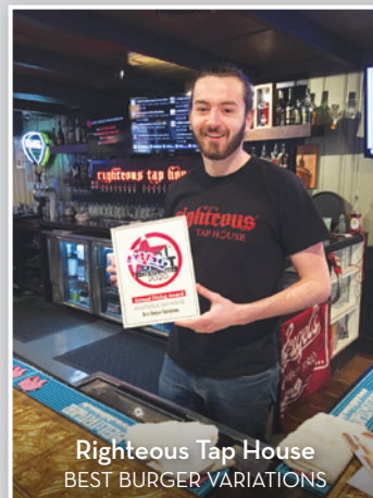
Righteous Tap House BEST BURGER VARIATIONS