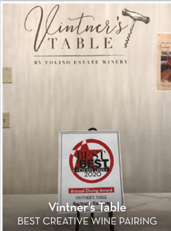
Vintner's Table BEST CREATIVE WINE PAIRING