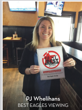
PJ Whelihans BEST EAGLES VIEWING