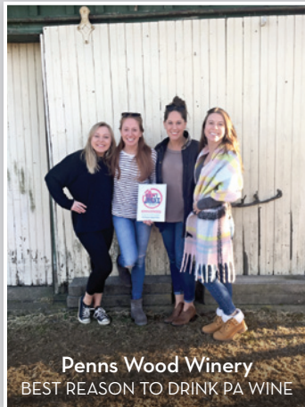
Penns Wood Winery BEST REASON TO DRINK PA WINE