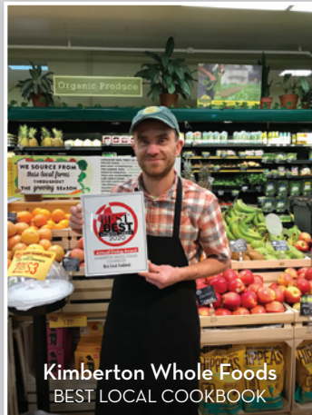
Kimberton Whole Foods BEST LOCAL COOKBOOK