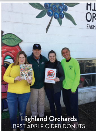
Highland Orchards BEST APPLE CIDER DONUTS