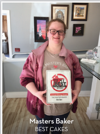
Masters Baker BEST CAKES