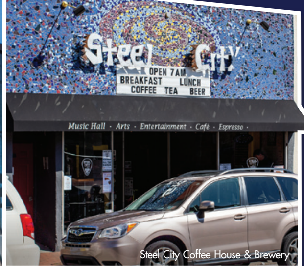
Steel City Coffee House & Brewery