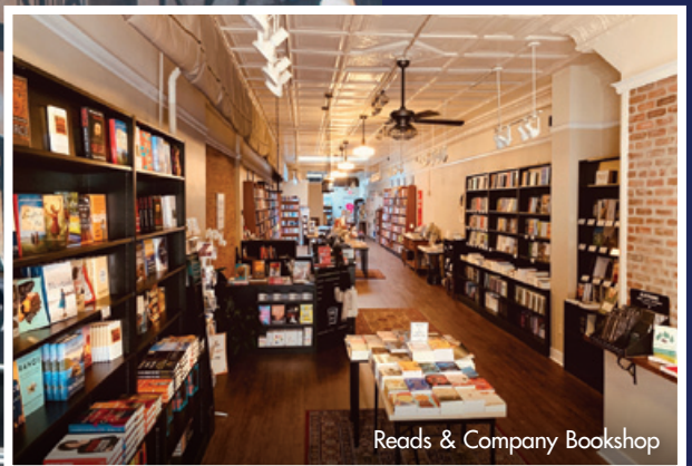
Reads & Company Bookshop