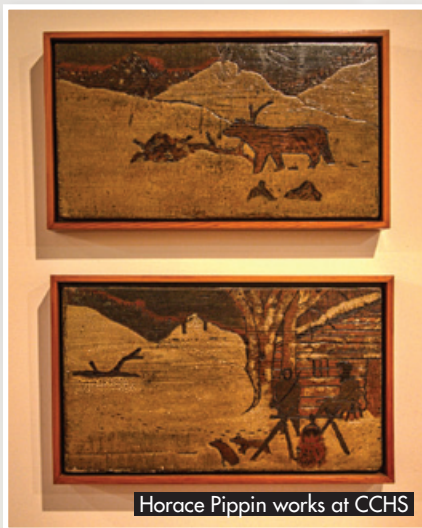
Horace Pippin works at CCHS