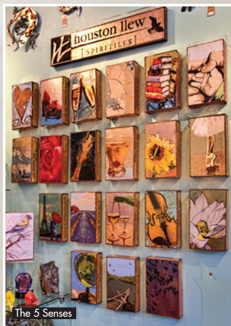
The 5 Senses