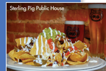
Sterling Pig Public House

113 W. Market St. 484-999-8026; SterlingPig.com Bringing great craft beer and BBQ to West Chester in the form of “Public House.” A casual and rustic atmosphere makes it the perfect space for people who are looking to have a great meal and a great time. Other locally made PA beers & spirits complement their award-winning brews and the from-scratch menu has something for everyone! Come join them for Happy Hour, Monday–Friday, 4 to 6 and Brunch on Sundays.