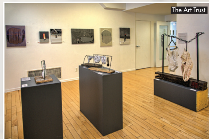
The Art Trust