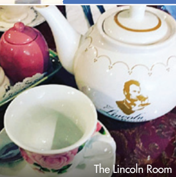
The Lincoln Room

28 W. Market St. 610-696-2102 LincolnRoomWestChester.com