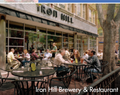
Iron Hill Brewery & Restaurant

3 W. Gay St. 610-738-9600; IronHillBrewery.com