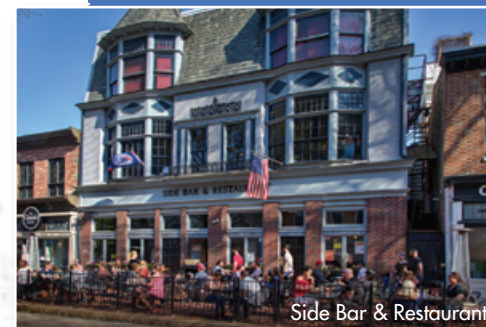
Side Bar & Restaurant

Side Bar and Restaurant is a casual restaurant and bar focusing on excellent and affordable food, craft beer and local spirits. They cater to young professionals, established business professionals and families. The restaurant and bar have a neighborhood feel and strive to be a place where a complete stranger will feel like a “regular.”