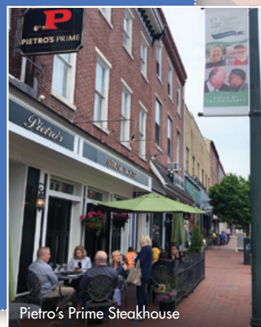
Pietro's Prime Steakhouse

125 W. Market St. 484-760-6100; PietrosPrime.com Pietro's Prime is an upscale, casual steak house and martini bar in the heart of downtown West Chester, serving prime cuts of beef and a variety of seafood selections. Dine in their rustic dining room setting or enjoy their outside patio seating. Stop by for live entertainment, Wednesday–Saturday, in the bar area along with their signature martinis and cocktails.