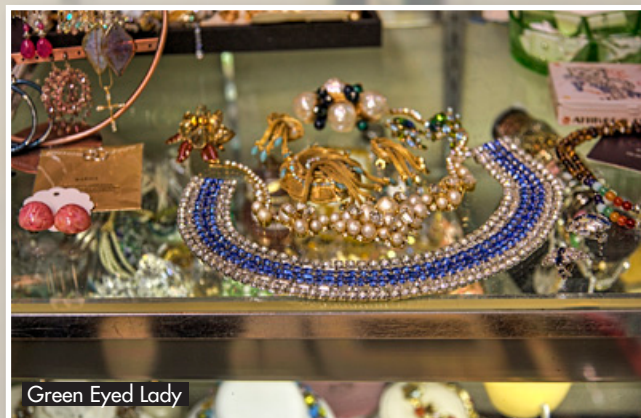
Green Eyed Lady