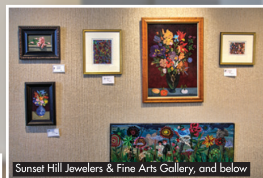
Sunset Hill Jewelers & Fine Arts Gallery, and below