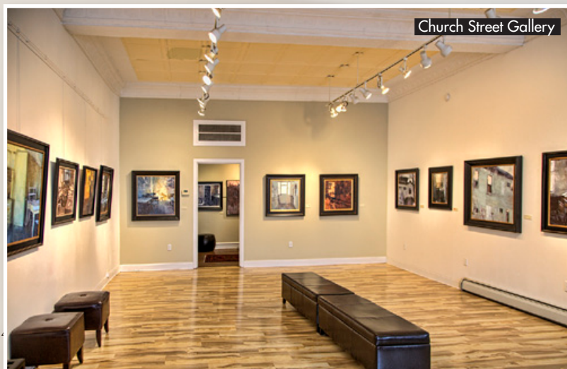
Church Street Gallery

A place with even longer history is Chester County Historical Society (CCHS) , 225 N. High St. Founded in 1893 and dedicated to collecting, preserving and exhibiting the history of the Chester County area, CCHS is a treasure trove just a block north of bustling Gay Street.