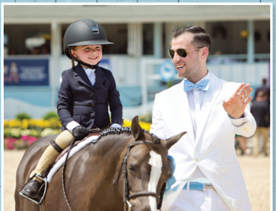
Devon Horse Show Photos Courtesy Brenda Carpenter