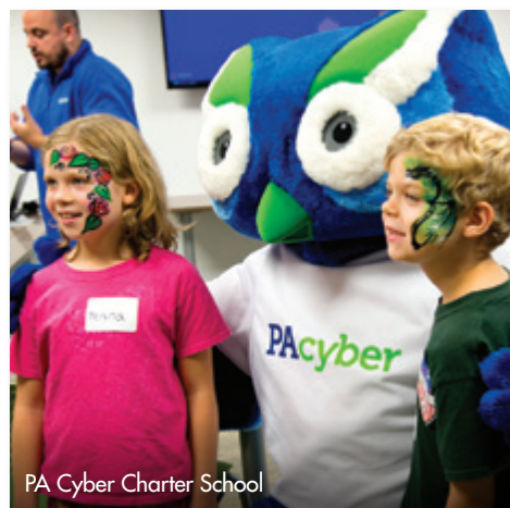
PA Cyber Charter School

Pennsylvania Association of Independent Schools' accreditation is a family's assurance that the school meets standards of excellence in administration, program, personnel, health and safety, and physical facilities. Member schools provide academic excellence, value the arts and athletics, and prepare students for a global society. PAIS is approved by the Pennsylvania State Board of Education to accredit schools in the Commonwealth. ♦