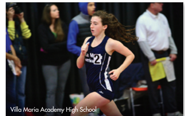
Villa Maria Academy High School