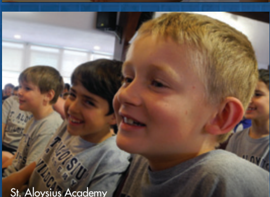
St. Aloysius Academy