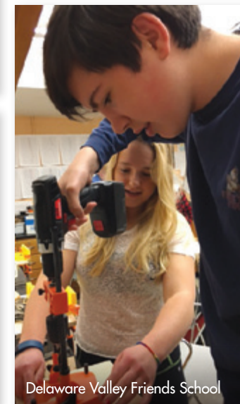
Delaware Valley Friends School