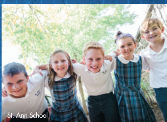
St. Ann School