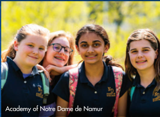
Academy of Notre Dame de Namur