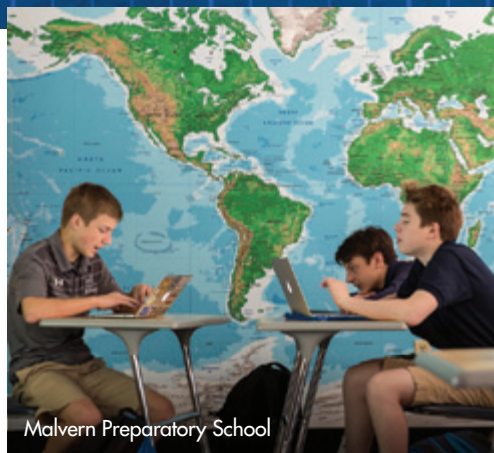
Malvern Preparatory School