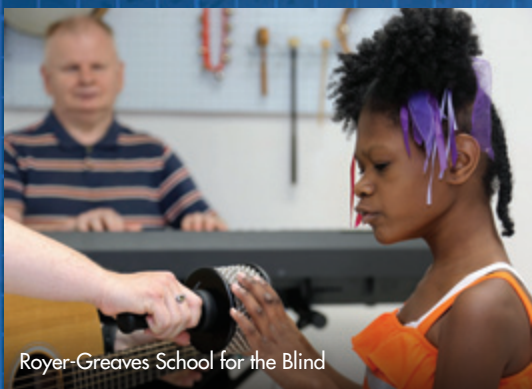
Royer-Greaves School for the Blind