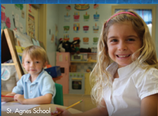
St. Agnes School