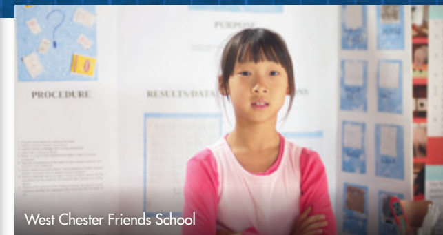
West Chester Friends School