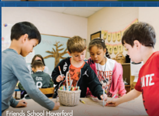
Friends School Haverford