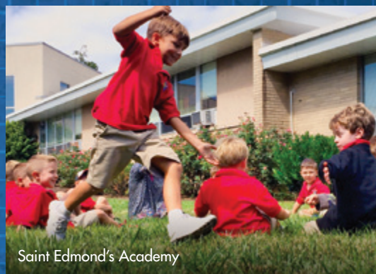
Saint Edmond's Academy