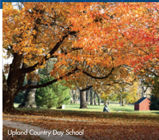
Upland Country Day School

education, aquatics, speech and language therapies, orientation and mobility, and occupational therapy.