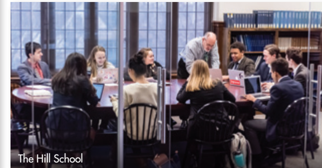
The Hill School