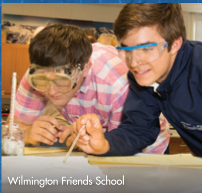
Wilmington Friends School