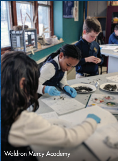
Waldron Mercy Academy