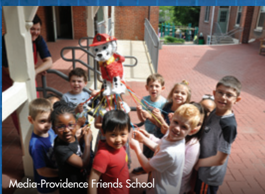
Media-Providence Friends School