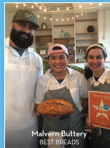
Malvern Buttery BEST BREADS