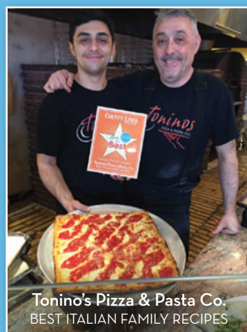
Tonino's Pizza & Pasta Co. BEST ITALIAN FAMILY RECIPES