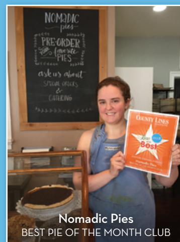
Nomadic Pies BEST PIE OF THE MONTH CLUB