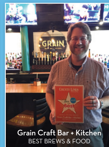
Grain Craft Bar + Kitchen BEST BREWS & FOOD