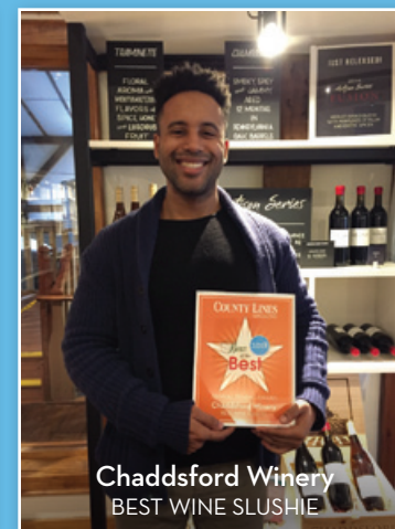
Chaddsford Winery BEST WINE SLUSHIE