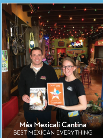
Más Mexicali Cantina BEST MEXICAN EVERYTHING