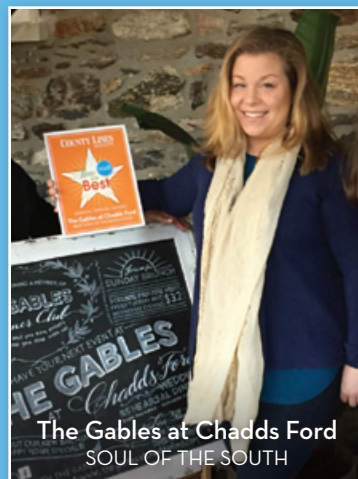
The Gables at Chadds Ford SOUL OF THE SOUTH