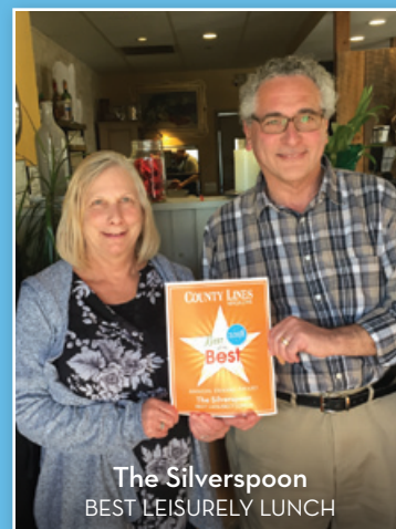
The Silverspoon BEST LEISURELY LUNCH