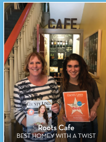
Roots Cafe BEST HOMEY WITH A TWIST