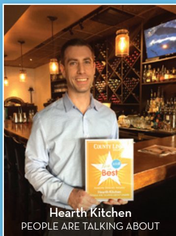
Hearth Kitchen PEOPLE ARE TALKING ABOUT