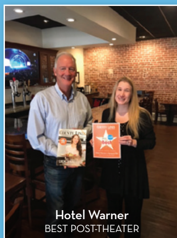
Hotel Warner BEST POST-THEATER