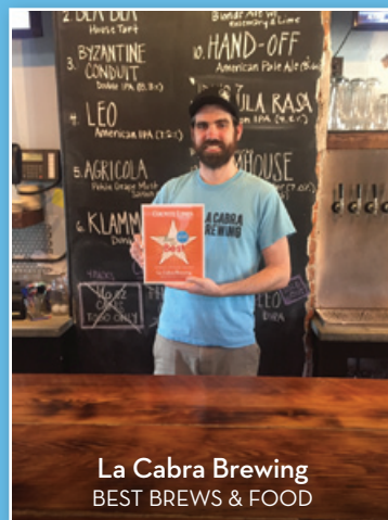
La Cabra Brewing BEST BREWS & FOOD