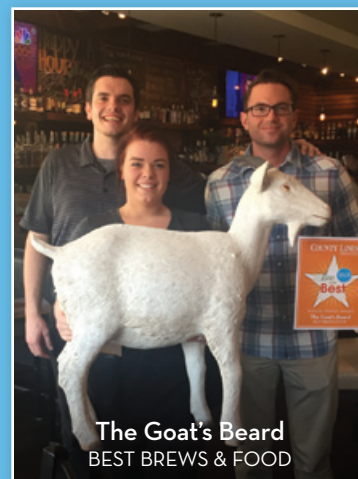
The Goat's Beard BEST BREWS & FOOD