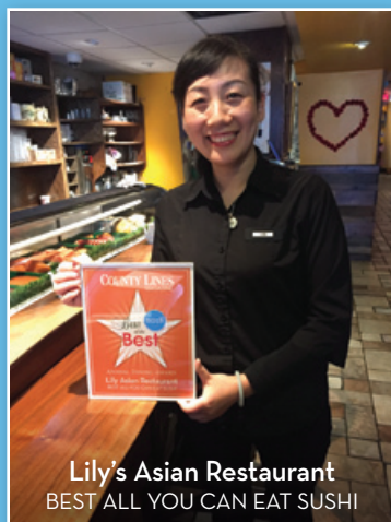
Lily's Asian Restaurant BEST ALL YOU CAN EAT SUSHI