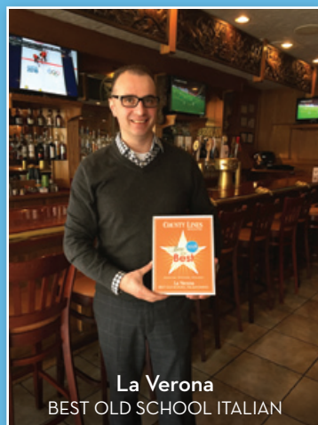
La Verona BEST OLD SCHOOL ITALIAN