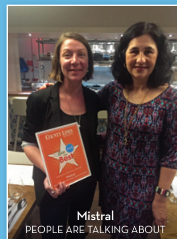
Mistral PEOPLE ARE TALKING ABOUT