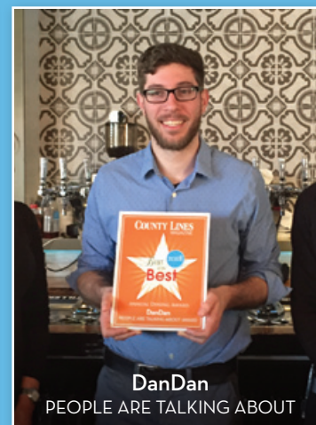
DanDan PEOPLE ARE TALKING ABOUT