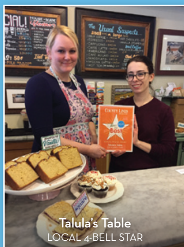
Talula's Table LOCAL 4-BELL STAR