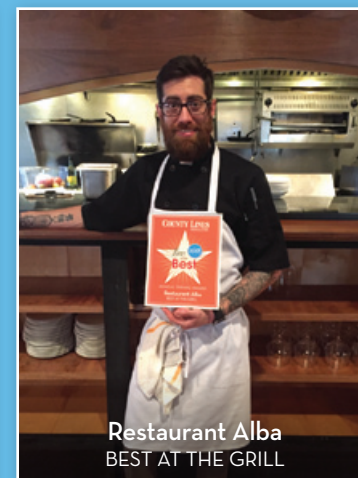
Restaurant Alba BEST AT THE GRILL