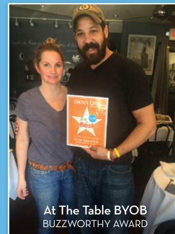
At The Table BYOB BUZZWORTHY AWARD