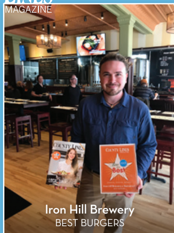
Iron Hill Brewery BEST BURGERS