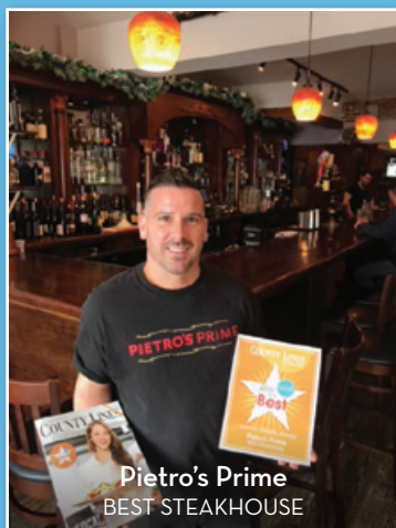
Pietro's Prime BEST STEAKHOUSE