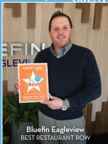
Bluefin Eagleview BEST RESTAURANT ROW