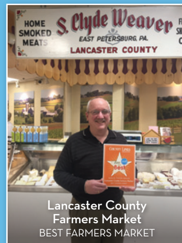
Lancaster County Farmers Market BEST FARMERS MARKET