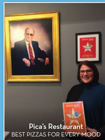
Pica's Restaurant BEST PIZZAS FOR EVERY MOOD