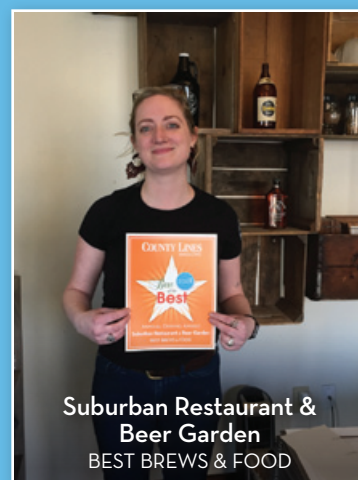
Suburban Restaurant & Beer Garden BEST BREWS & FOOD