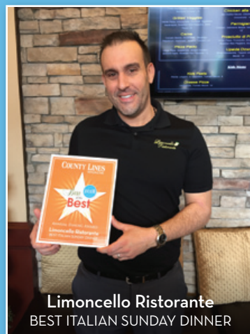
Limoncello Ristorante BEST ITALIAN SUNDAY DINNER