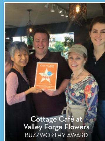
Cottage Café at Valley Forge Flowers BUZZWORTHY AWARD