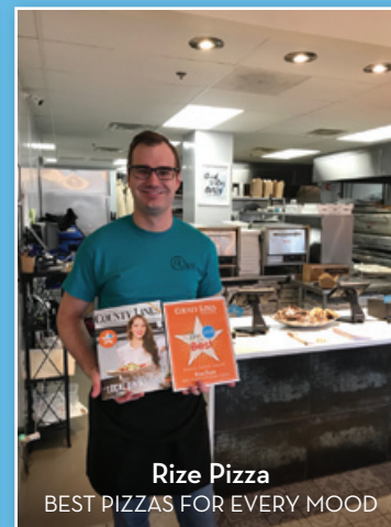
Rize Pizza BEST PIZZAS FOR EVERY MOOD