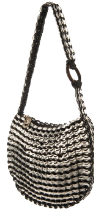
Maria Evening Soda Tab Bag, Escama Studio The Merchant of Menace, West Chester