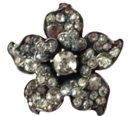
Victorian Diamond Brooch, Circa 1880 Sunset Hill Jewelers, West Chester