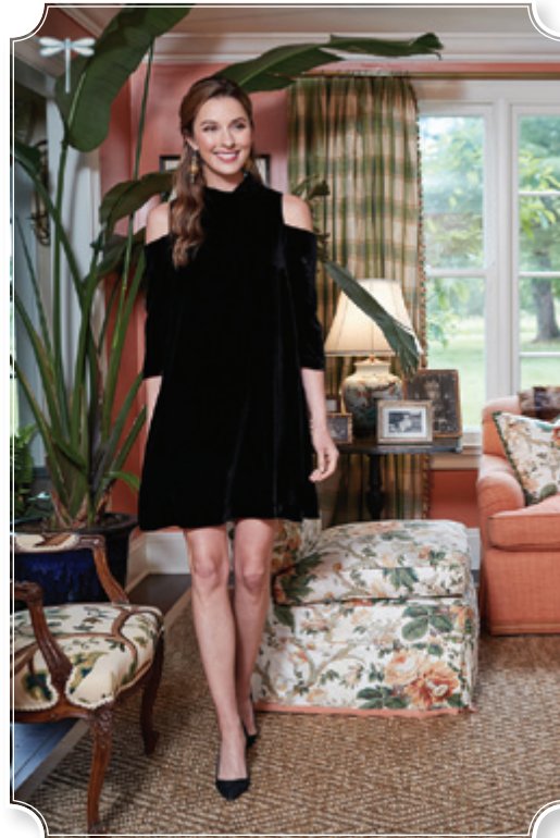
Cold Shoulder Mock Neck Velvet Dress, Tyler Boe KALY, West Chester