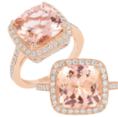
Rose Gold & Diamond Rings, Costar Big Diamond Importers & Fine Jewelry, West Chester