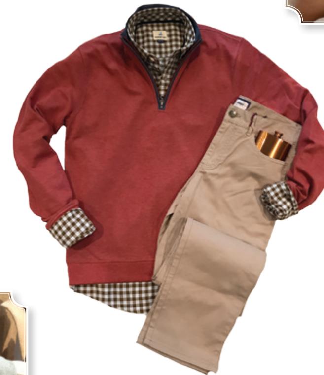
Sully 1/4 Zip Pullover, Bobby "Hangin' Out" Button Down & Cal Pant, Johnnie-O Phineas Gage, West Chester