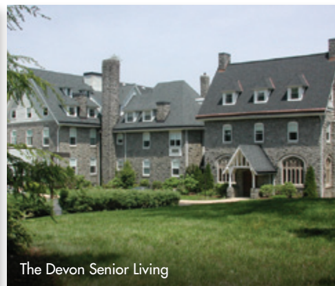
The Devon Senior Living