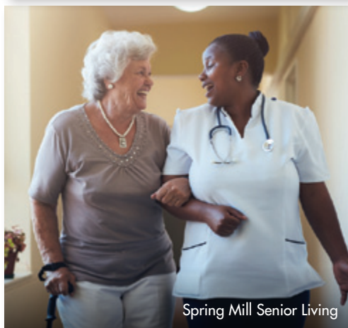
Spring Mill Senior Living