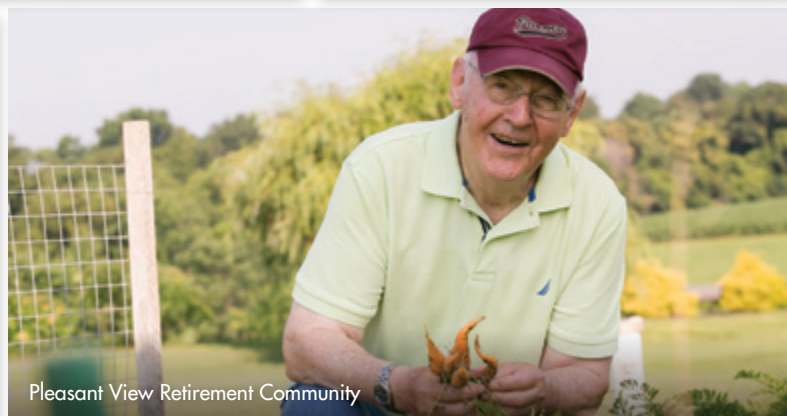
Pleasant View Retirement Community

apartments, Daylesford Crossing is located right in the heart of the upper Main Line. Call to find out more.