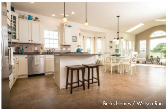
Berks Homes / Watson Run