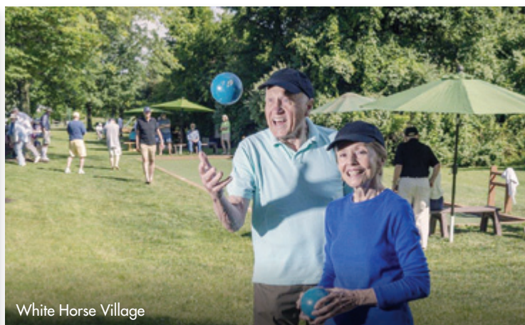
White Horse Village