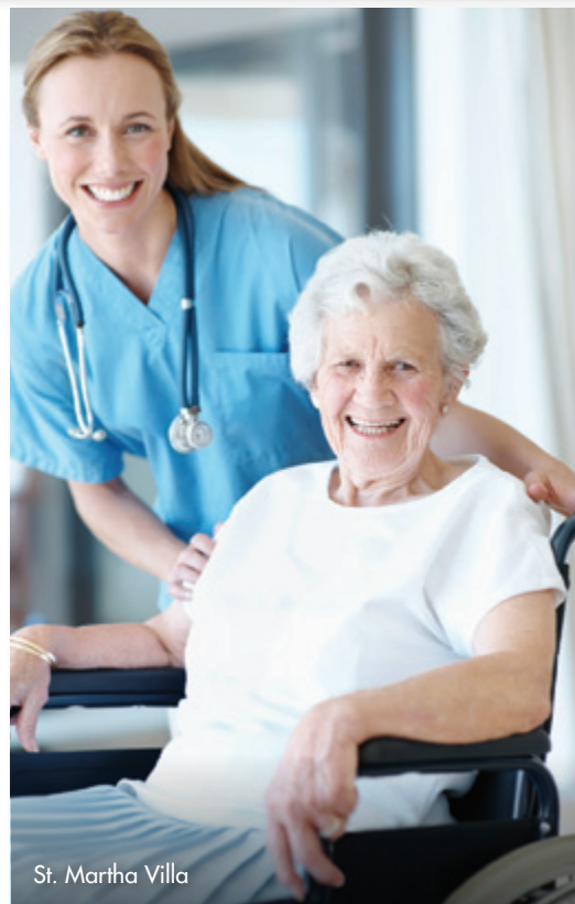
St. Martha Villa

Daylesford Crossing is senior living, but different ... completely customized support, uniquely sophisticated surroundings and unparalleled hospitality. With 78 supportive living and specialized memory care