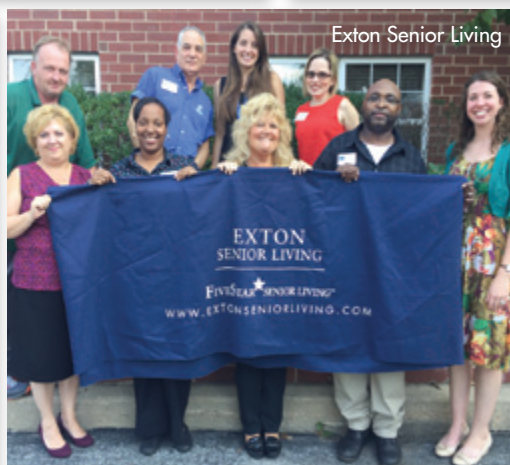
Exton Senior Living