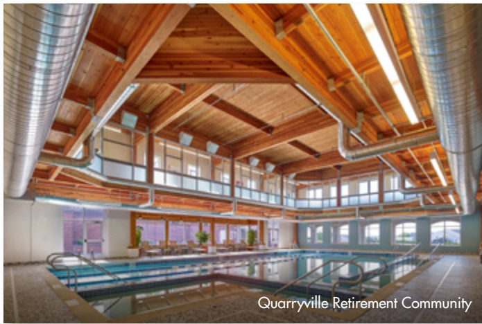
Quarryville Retirement Community