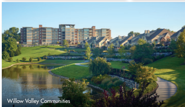
Willow Valley Communities