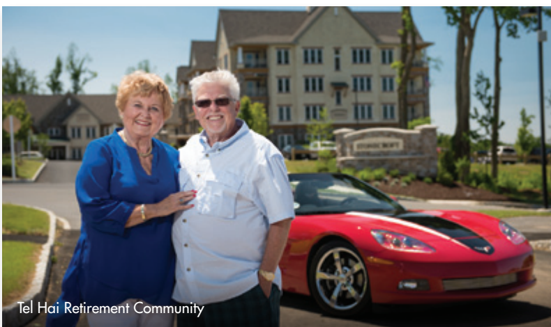
Tel Hai Retirement Community