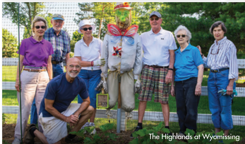
The Highlands at Wyomissing