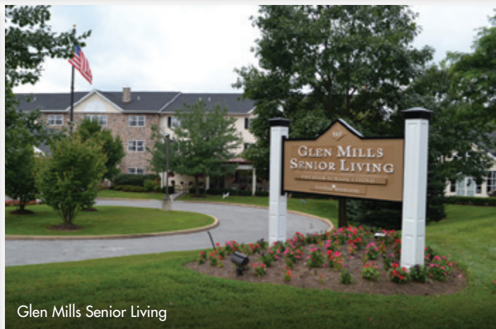
Glen Mills Senior Living

flexible dining program and much more. Riddle Village has 10 spacious apartment styles ranging from studios to three-bedroom apartments.