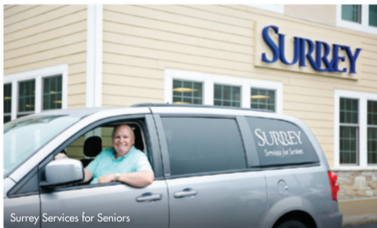
Surrey Services for Seniors