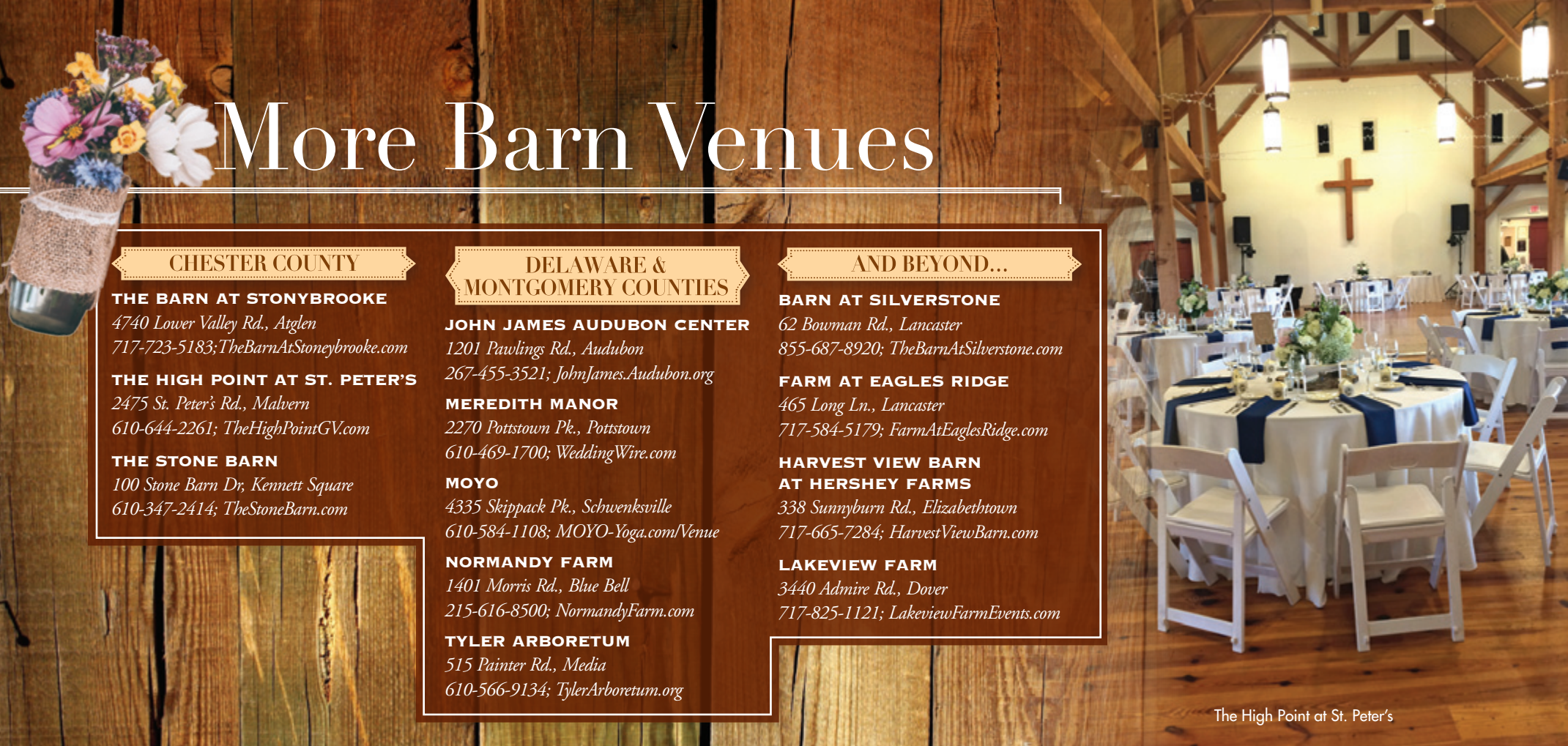
The High Point at St. Peter's