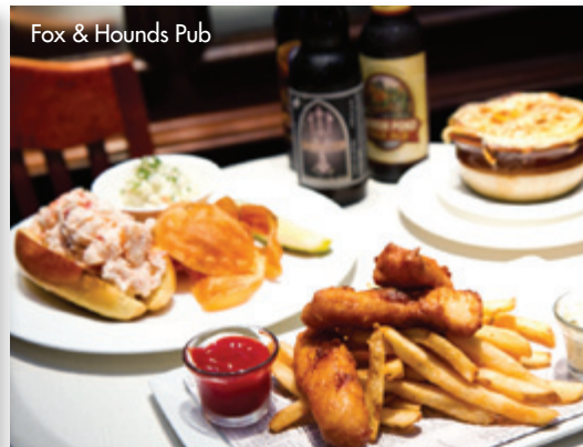
Fox & Hounds Pub

Suburban, committed to supporting local, offers two unique dining experiences. The Beer Garden, a social atmosphere specializing in PA craft beers and farm fresh cuisine, while the intimate Farmers Room boasts a curated menu along with a refined cocktail/wine list. Sunday Brunch with bottomless mimosas and Bloody Marys is a must. Daily Specials. Open daily 11:30 to midnight.