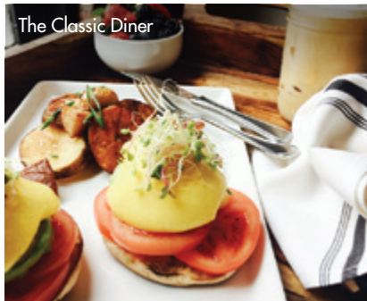
The Classic Diner

352 Lancaster Ave. 610.725.0515; TheClassicDinerPA.com See their listing in West Chester feature.