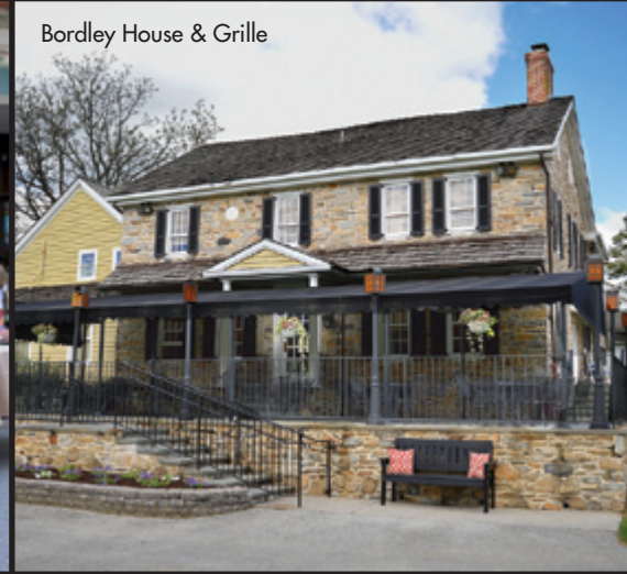
Bordley House & Grille