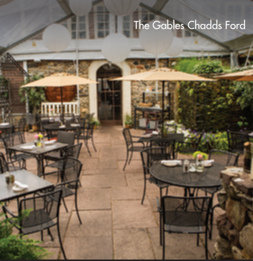
The Gables Chadds Ford