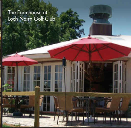
The Farmhouse at Loch Nairn Golf Club