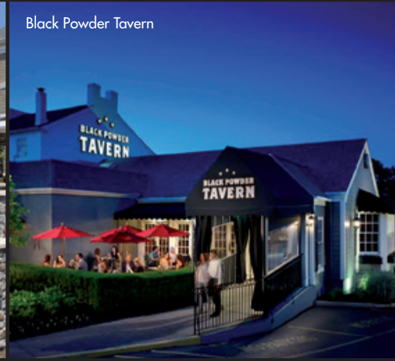
Black Powder Tavern