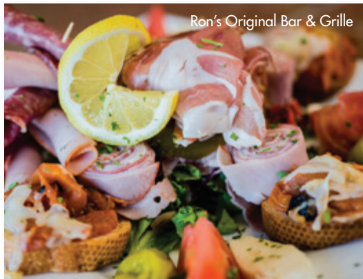
Ron's Original Bar & Grille