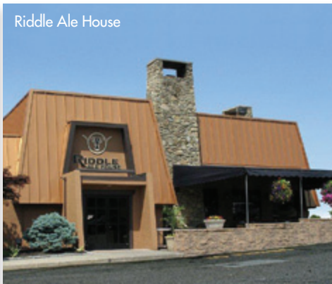
Riddle Ale House