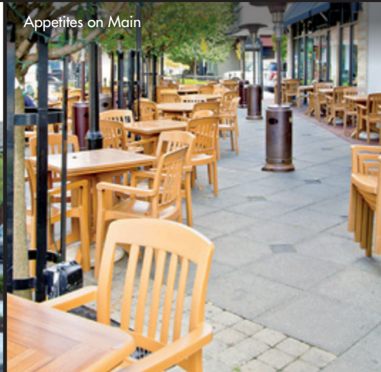
Appetites on Main