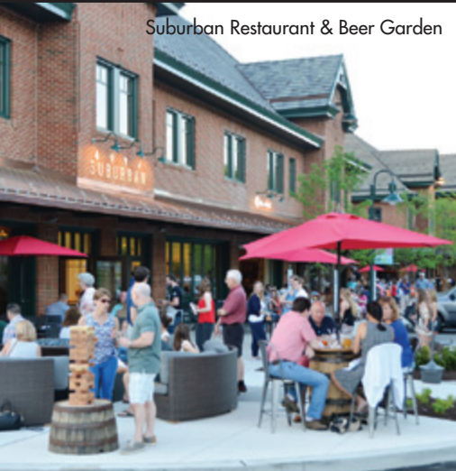
Suburban Restaurant & Beer Garden