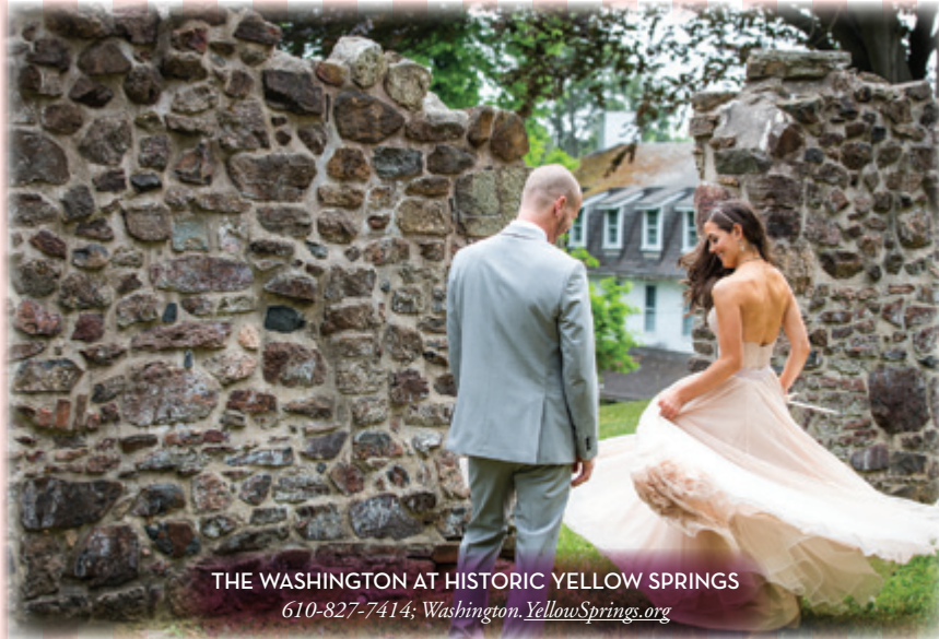
THE WASHINGTON AT HISTORIC YELLOW SPRINGS 610-827-7414; Washington.YellowSprings.org