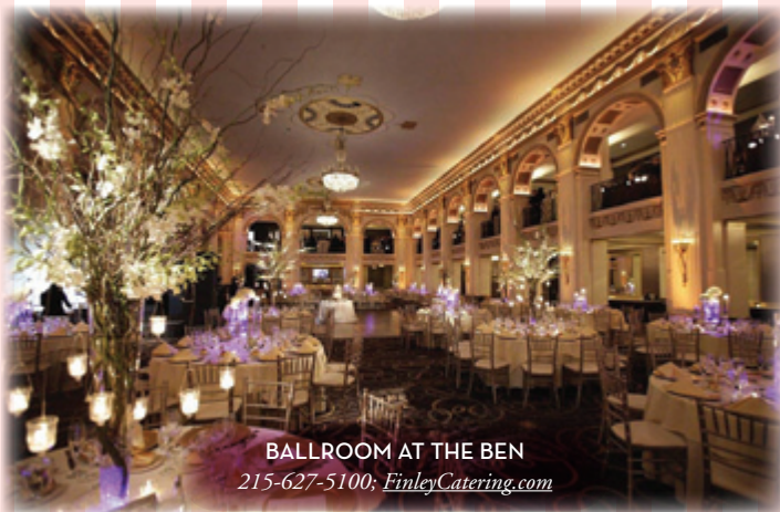
BALLROOM AT THE BEN 215-627-5100; FinleyCatering.com