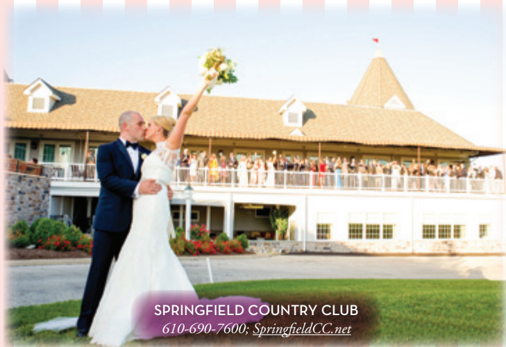
SPRINGFIELD COUNTRY CLUB 610-690-7600; SpringfieldCC.net

430 Hannum Ave., West Chester 610-431-9378; BallroomAtTheWestside.com