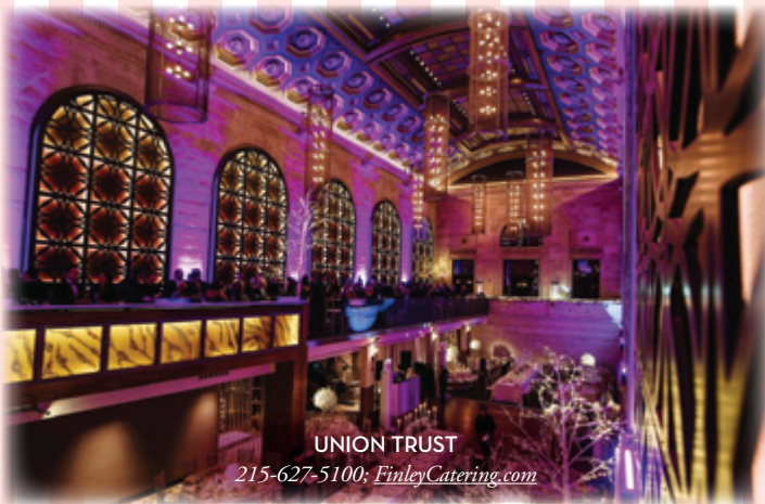
UNION TRUST 215-627-5100; FinleyCatering.com