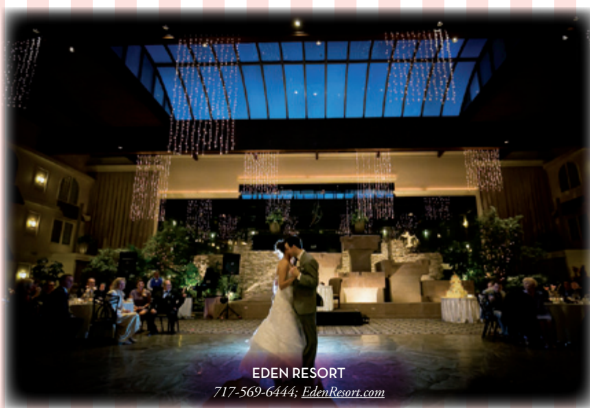
EDEN RESORT 717-569-6444; EdenResort.com