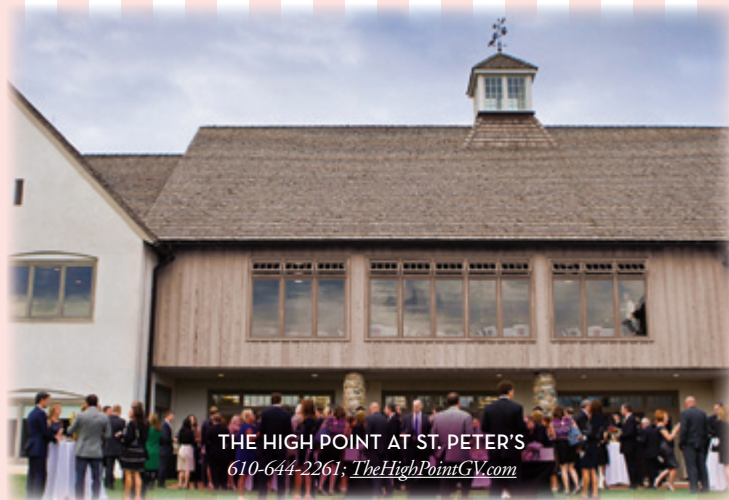
THE HIGH POINT AT ST. PETER'S 610-644-2261; TheHighPointGV.com