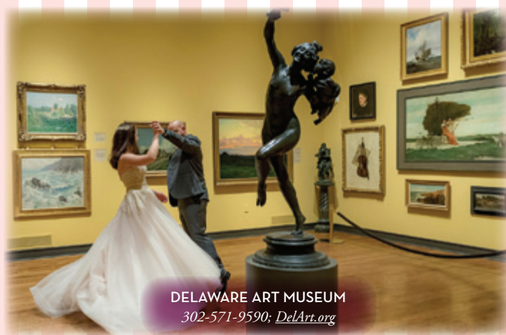
DELAWARE ART MUSEUM 302-571-9590; DelArt.org