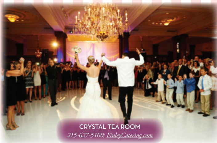
CRYSTAL TEA ROOM 215-627-5100; FinleyCatering.com

receptions, along with 8 guests suites. Perfect for intimate weddings and receptions for 15–125 guests, rehearsal dinners for 75p, three private dining rooms, honeymoon/guests suites. Award-winning American cuisine with attentive, professional service. Formal wedding and casual celebrations are their specialty.