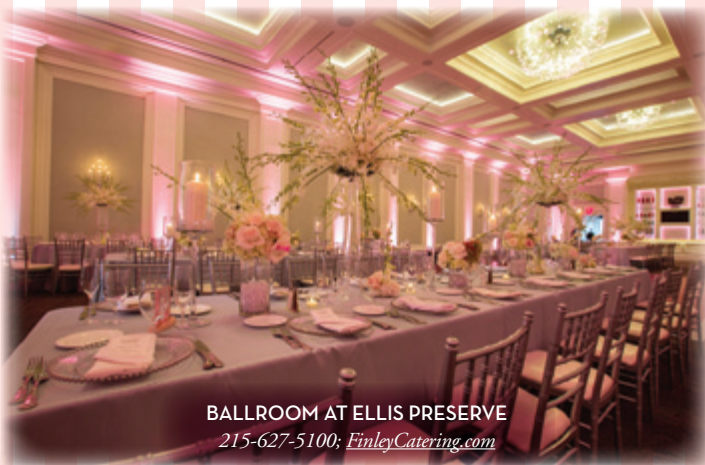
BALLROOM AT ELLIS PRESERVE 215-627-5100; FinleyCatering.com