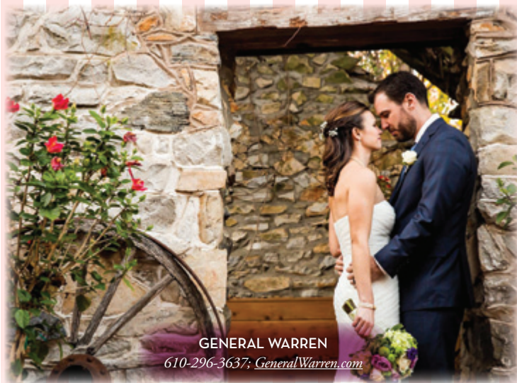
GENERAL WARREN 610-296-3637; GeneralWarren.com