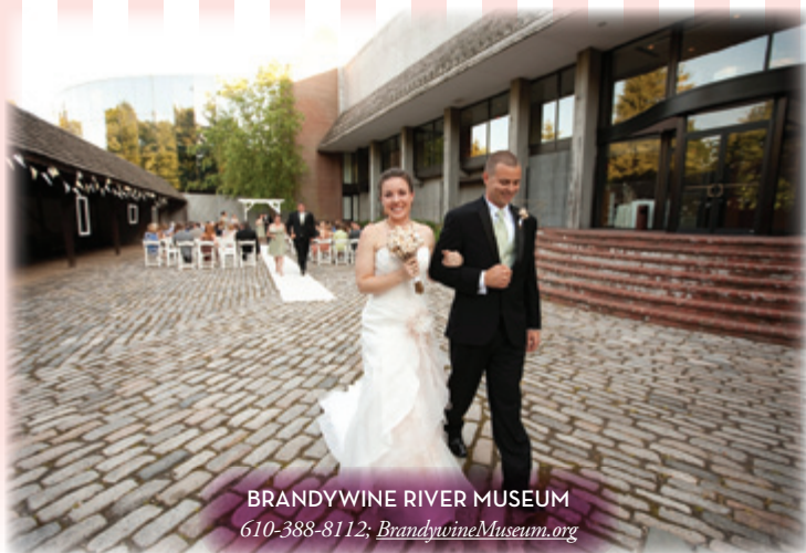
BRANDYWINE RIVER MUSEUM 610-388-8112; BrandywineMuseum.org