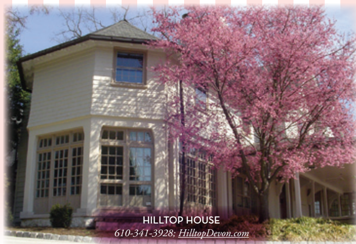
HILLTOP HOUSE 610-341-3928; HilltopDevon.com