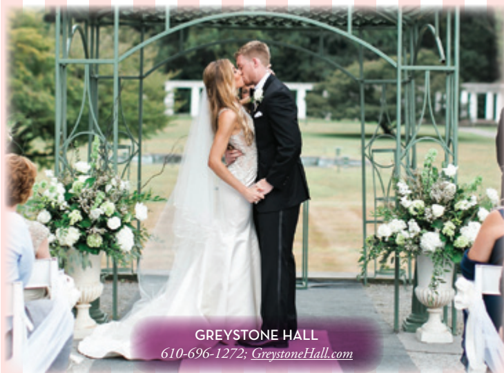
GREYSTONE HALL 610-696-1272; GreystoneHall.com

Here's our list (with beautiful photos) of the best local venues.