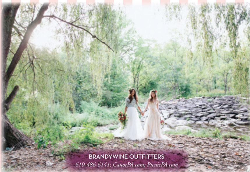
BRANDYWINE OUTFITTERS 610-486-6141; CanoePA.com ; PicnicPA.com