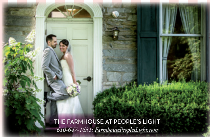
THE FARMHOUSE AT PEOPLE'S LIGHT 610-647-1631; FarmhousePeoplesLight.com