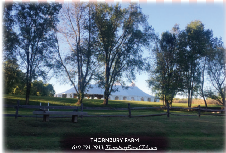
THORNBURY FARM 610-793-2933; ThornburyFarmCSA.com