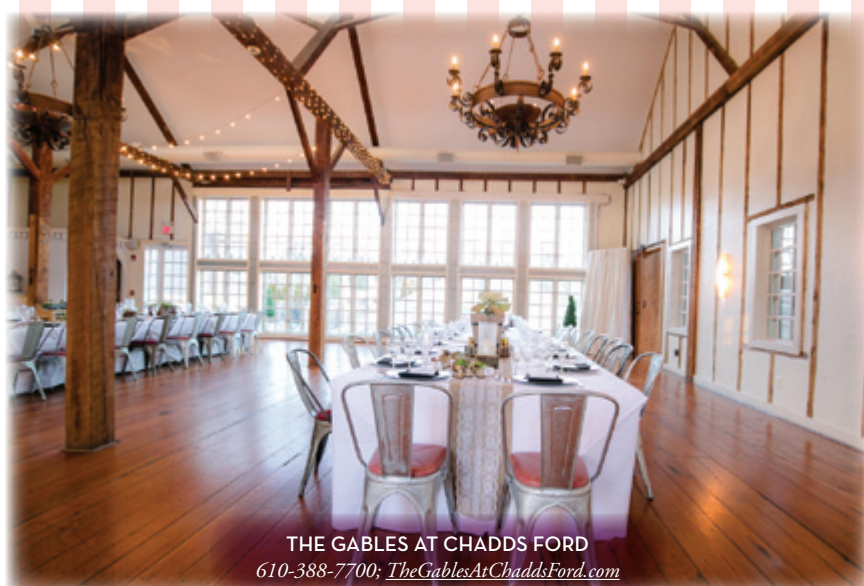
THE GABLES AT CHADDS FORD 610-388-7700; TheGablesAtChaddsFord.com