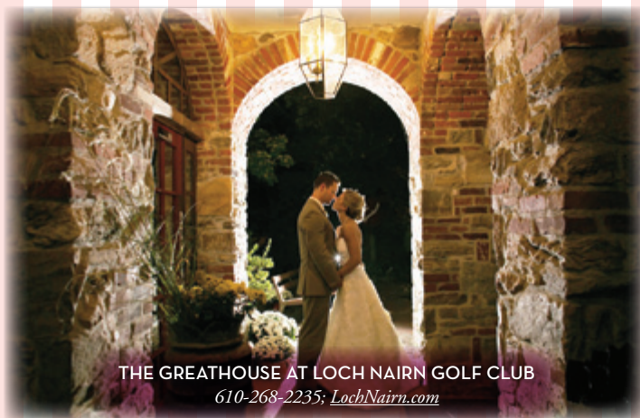
THE GREATHOUSE AT LOCH NAIRN GOLF CLUB 610-268-2235; LochNairn.com