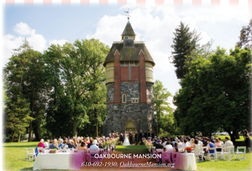
OAKBOURNE MANSION 610-692-1930; OakbourneMansion.org