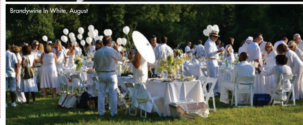
Brandywine In White, August