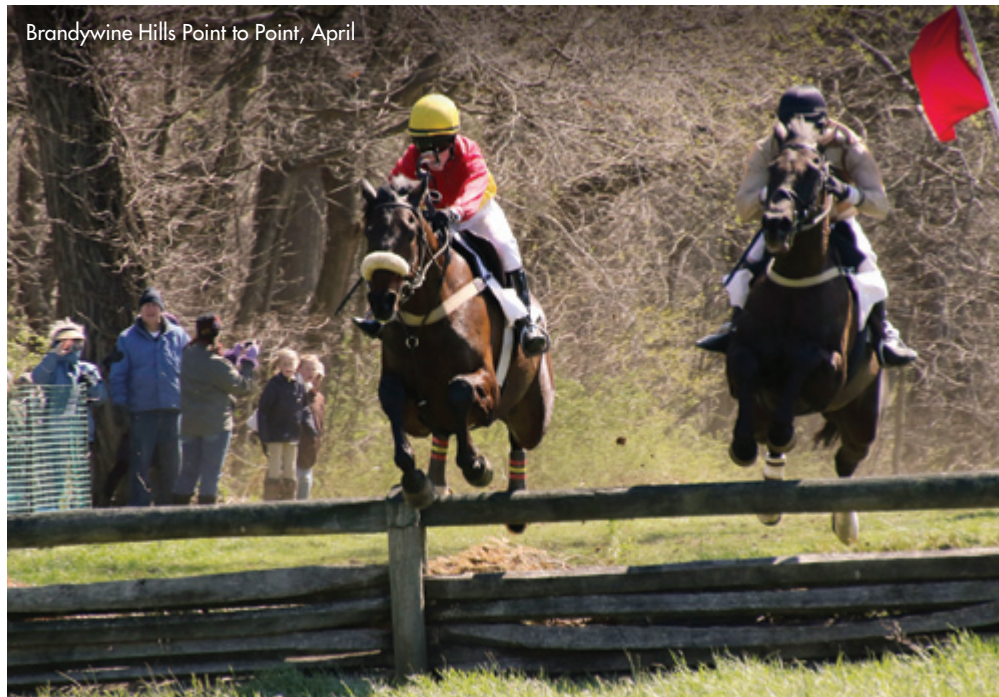
Brandywine Hills Point to Point, April

MARCH 30 See artists in action as six artists create pieces live, at a gala-like event, at Oakbourne Mansion. These, along with other works, will be auctioned. Benefits The