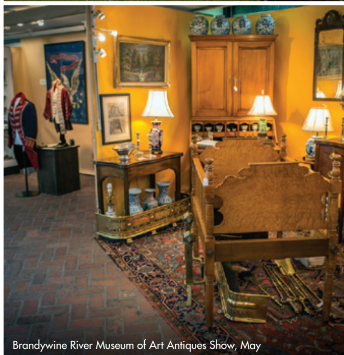
Brandywine River Museum of Art Antiques Show, May