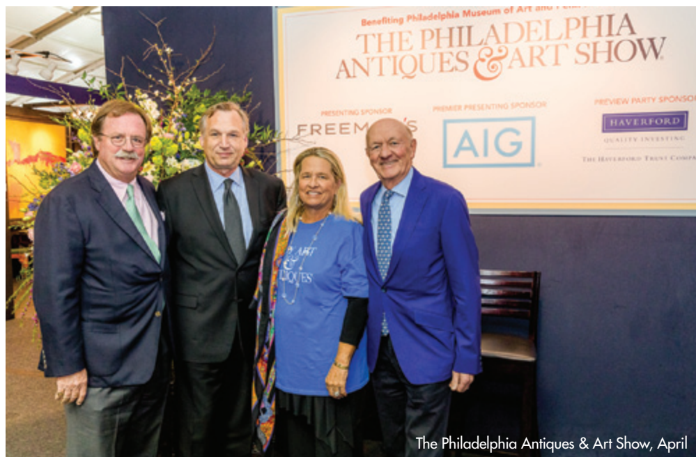
The Philadelphia Antiques & Art Show, April

Fun, food and philanthropy—Chester County's finest dessert chefs showcase their delectable creations at this annual fundraiser. A sweet time. Whitford Country Club, 600 Whitford Hills Rd., Exton. 610-696-8211; ChesCoCF.org.