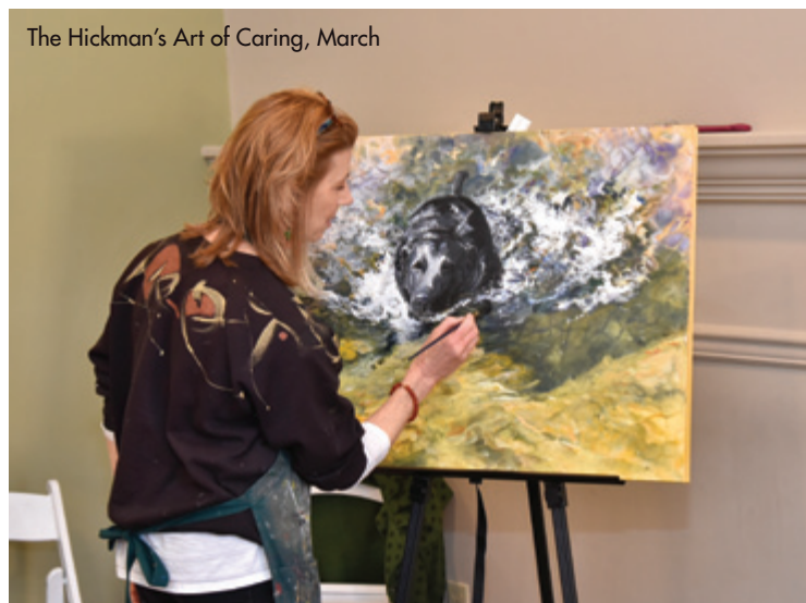
The Hickman's Art of Caring, March