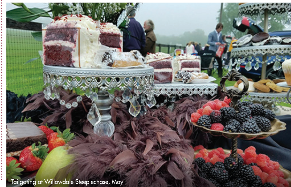
Tailgating at Willowdale Steeplechase, May

AUGUST 24 The Brandywine Valley's Pop-Up BYO Summer Gala, held at a secret location, revealed before the event. Guests wear white and provide their picnic dinner, wine, centerpiece, candles, etc. Benefits Neighbors for Crebilly's work to save open space. Facebook.com/BrandywineInWhite .