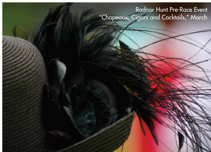
Radnor Hunt Pre-Race Event "Chapeaux, Cigars and Cocktails," March