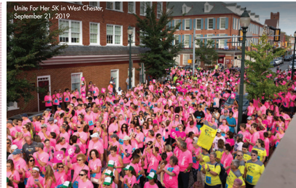
Unite For Her 5K in West Chester, September 21, 2019

Join 500+ riders to bike the beautiful country roads, enjoy an awards ceremony, great food