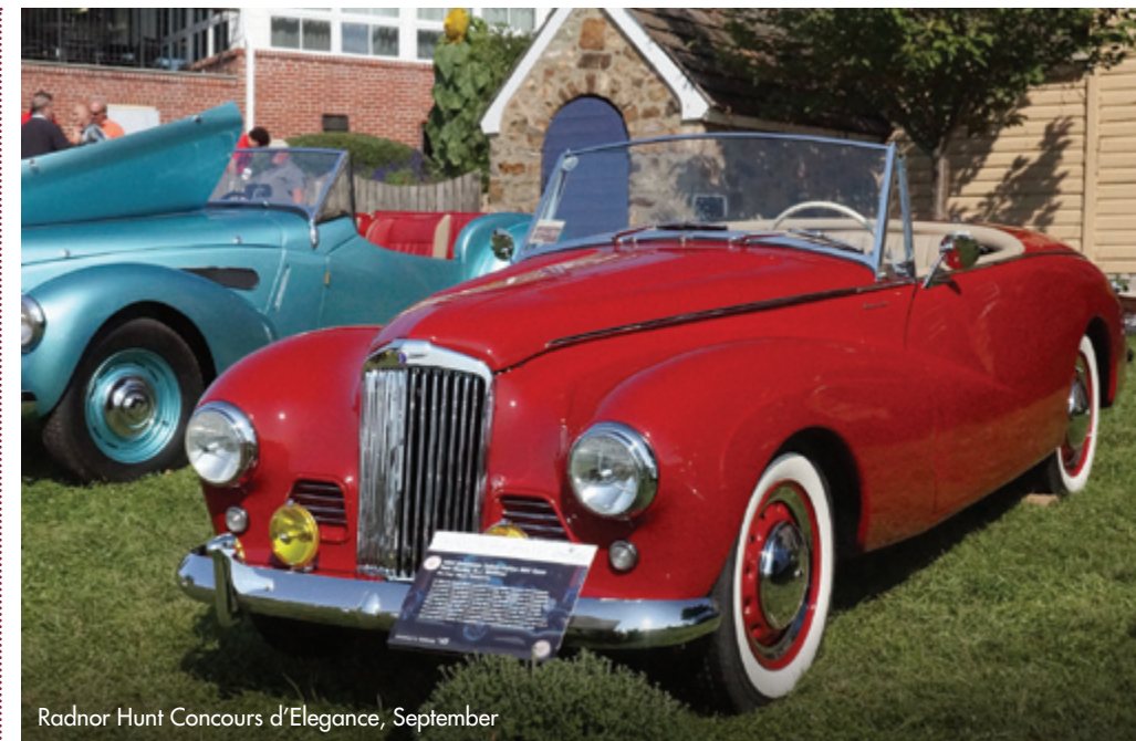
Radnor Hunt Concours d'Elegance, September

Ring in the New Year at this fun-filled gala to support the Uptown! Knaus Performing Arts Center at West Chester's "Party of the Year." In 2018 the theme was "Puttin' on the Glitz." Fabulous food and, of course, lots of entertainment. 226 N. High St., West Chester. 610-356-2787; UptownWestChester.org. ♦