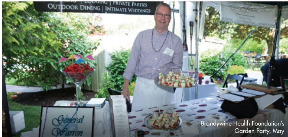
Brandywine Health Foundation's Garden Party, May