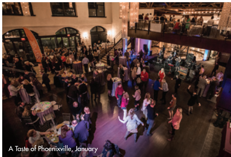
A Taste of Phoenixville, January