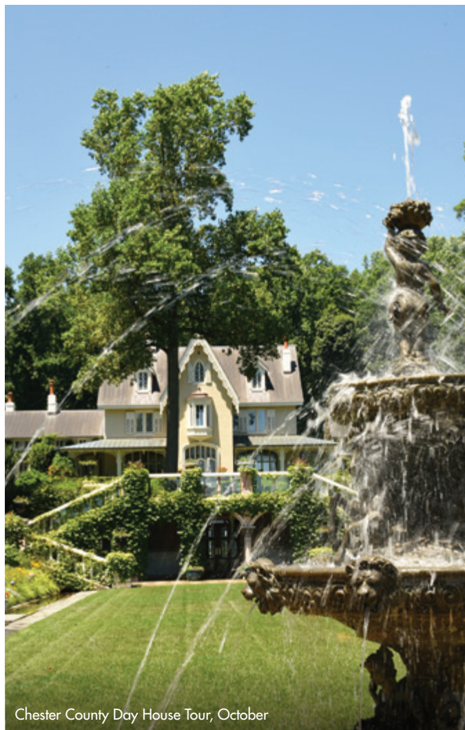
Chester County Day House Tour, October