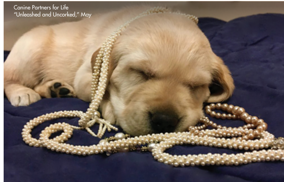
Canine Partners for Life "Unleashed and Uncorked," May

DuPont Country Club, 1001 Rockland Rd., Wilmington. 302-656-3257; MealsOnWheelsDE.org.