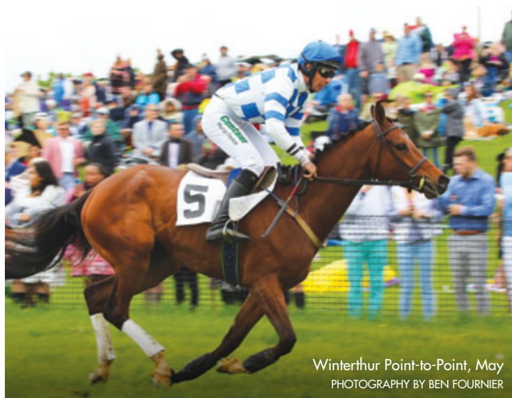
Winterthur Point-to-Point, May

Check our Best Local Events feature each month in County Lines Magazine and on our website, CountyLinesMagazine.com , for updates to these events and many more throughout the year. To have your event in next year's datebook, contact Info@ValleyDel.com . Space is limited!