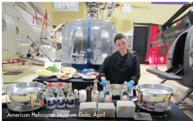
American Helicopter Museum Gala, April