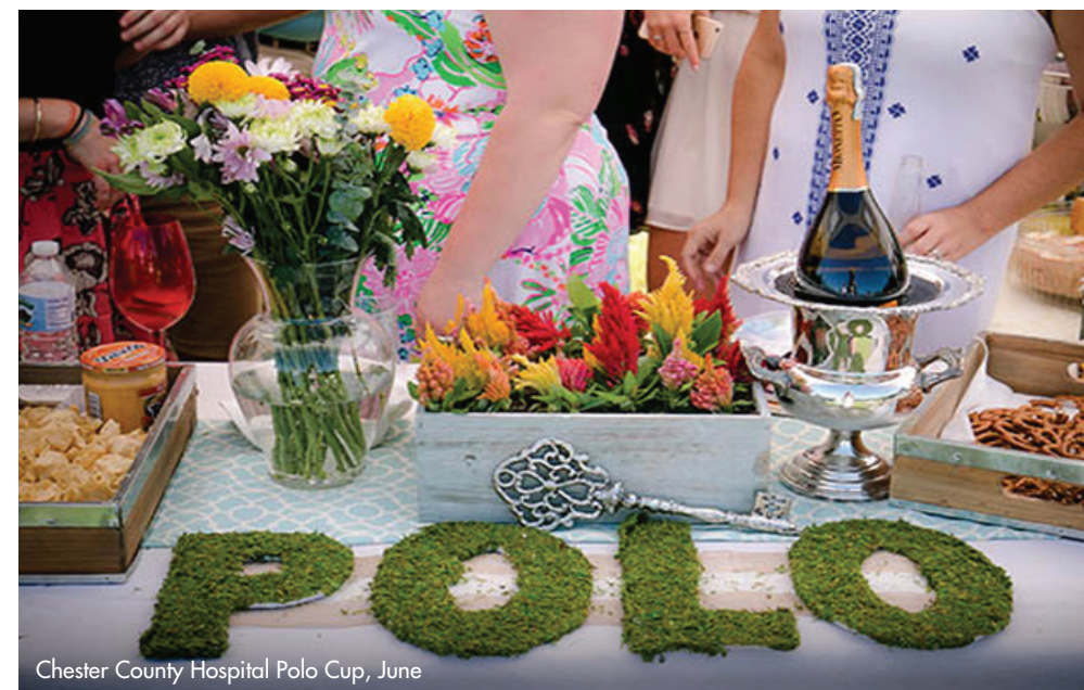
Chester County Hospital Polo Cup, June