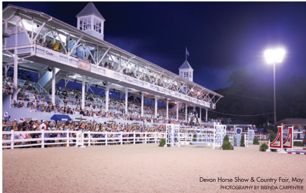
Devon Horse Show & Country Fair, May

Join an exclusive tour of several of the Willistown area's unique and beautiful barns and farms, followed by a bountiful barbecue supper. Cocktails, hors d'oeuvres, barbecue and auction follow. Benefits the Trust's conservation works. 610-353-2562; WCTrust.org .