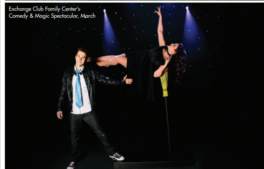
Exchange Club Family Center's Comedy & Magic Spectacular, March