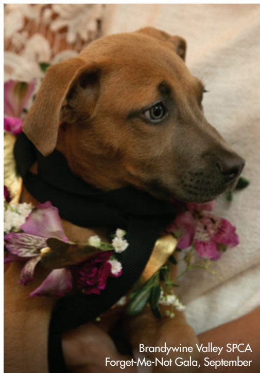
Brandywine Valley SPCA Forget-Me-Not Gala, September