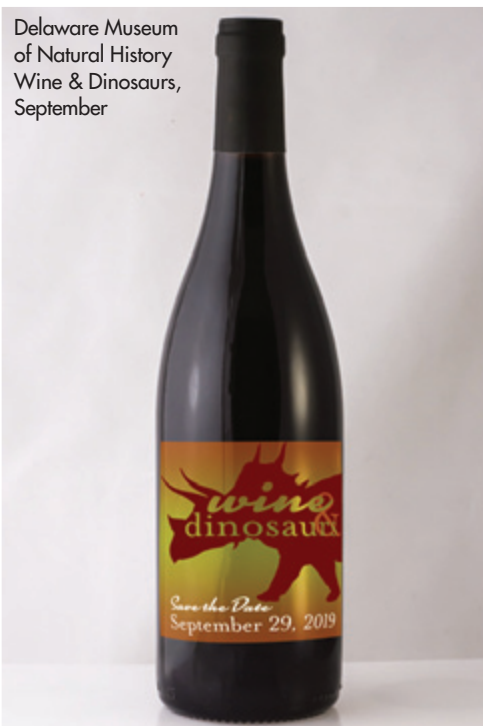
Delaware Museum of Natural History Wine & Dinosaurs, September