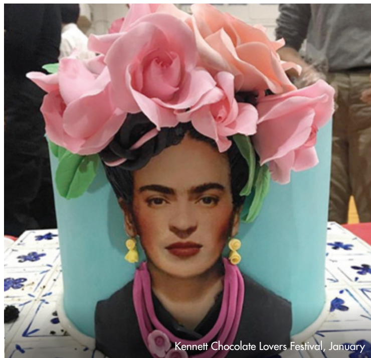
Kennett Chocolate Lovers Festival, January