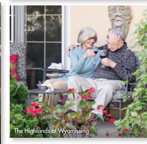
The Highlands at Wyomissing