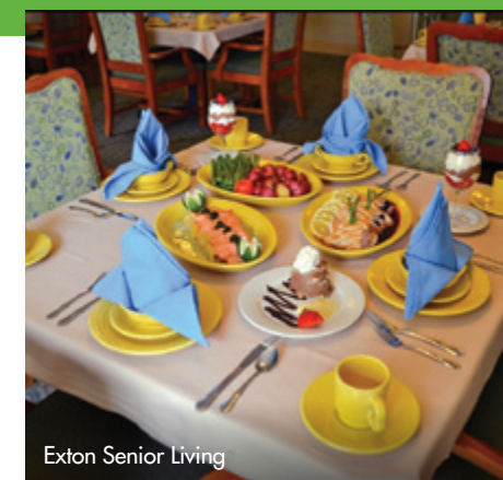
Exton Senior Living

Riddle Village is a Lifecare community that offers amenities including a fitness center, putting green, indoor parking, personal trainer, four unique restaurants, a flexible dining program and much more. Riddle Village has 10 spacious apartment styles ranging from studios to three-bedroom apartments.