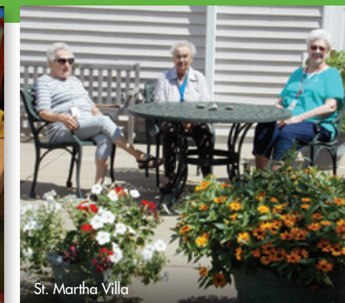
St. Martha Villa