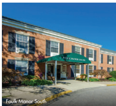
Foulk Manor South

The Highlands at Wyomissing is a non-profit Life Care Continuing Care Retirement Community.