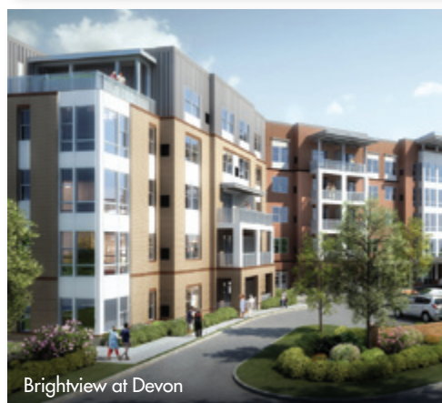
Brightview at Devon