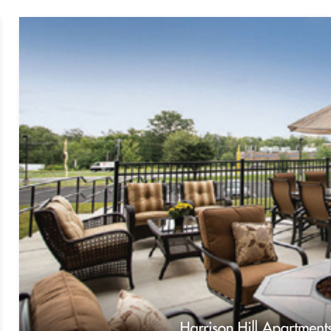
Harrison Hill Apartments