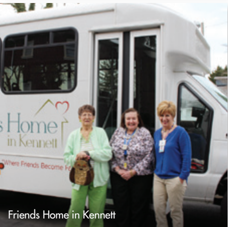
Friends Home in Kennett