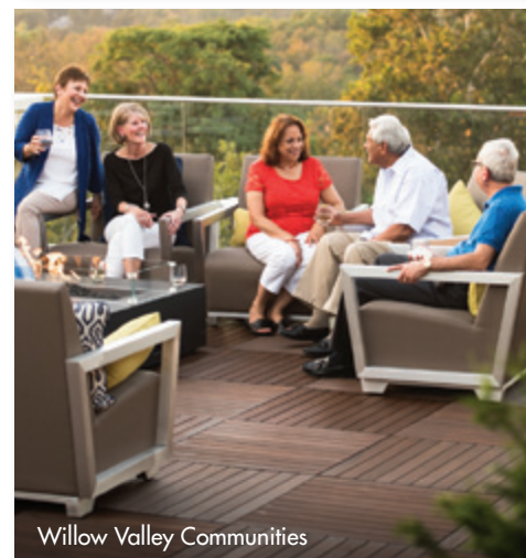
Willow Valley Communities