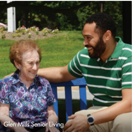
Glen Mills Senior Living