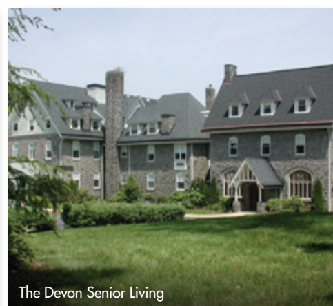
The Devon Senior Living