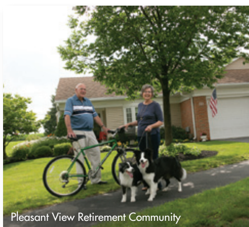
Pleasant View Retirement Community