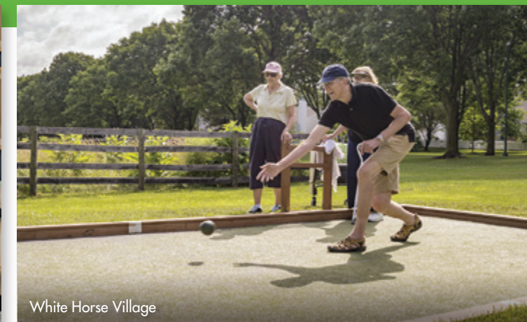
White Horse Village